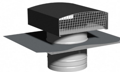
Ø250mm Slate Roof Terminal

New vent cowl to roof - vent rises from below ~ 160 l/s