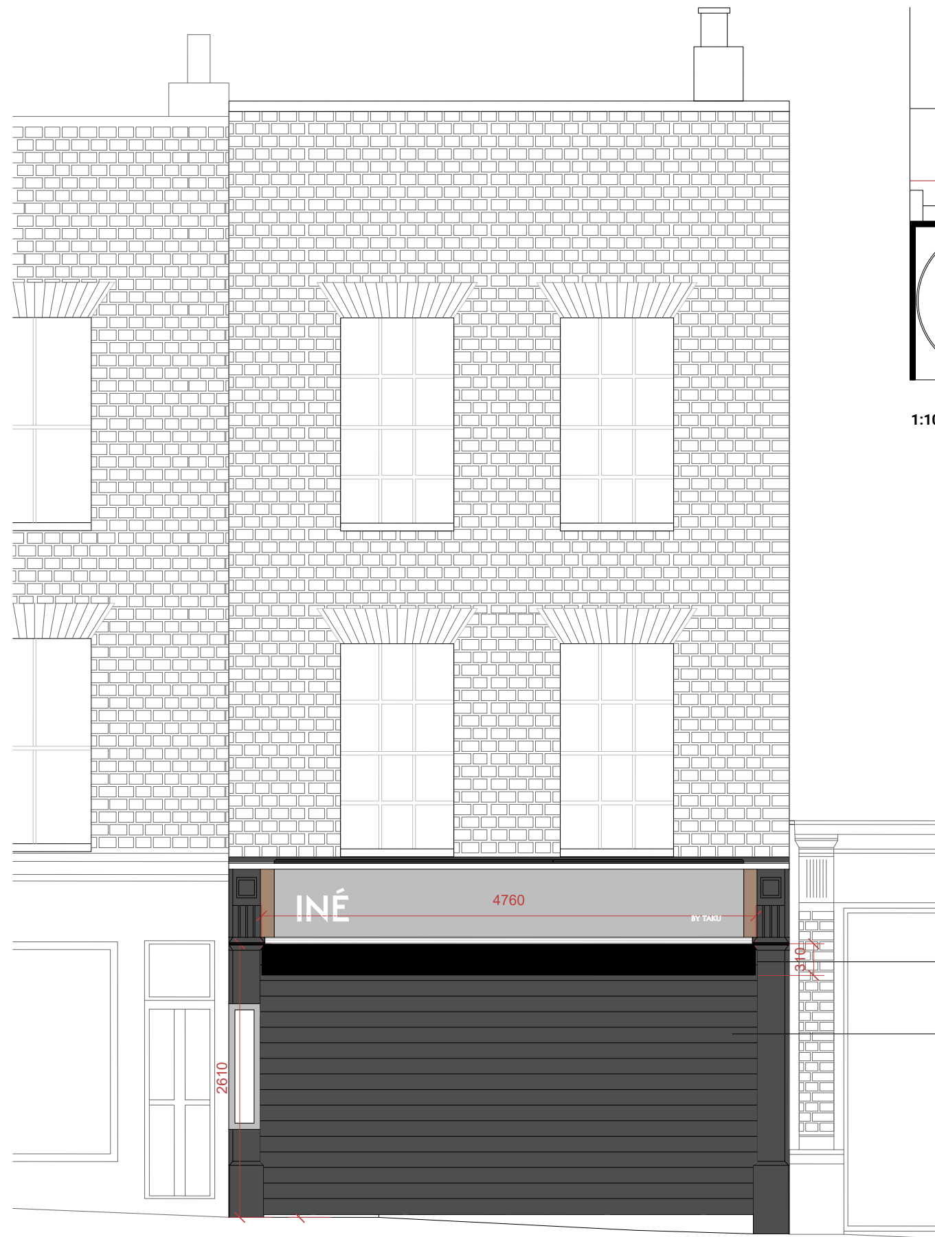
PROPOSED FACADE DESIGN 1:50