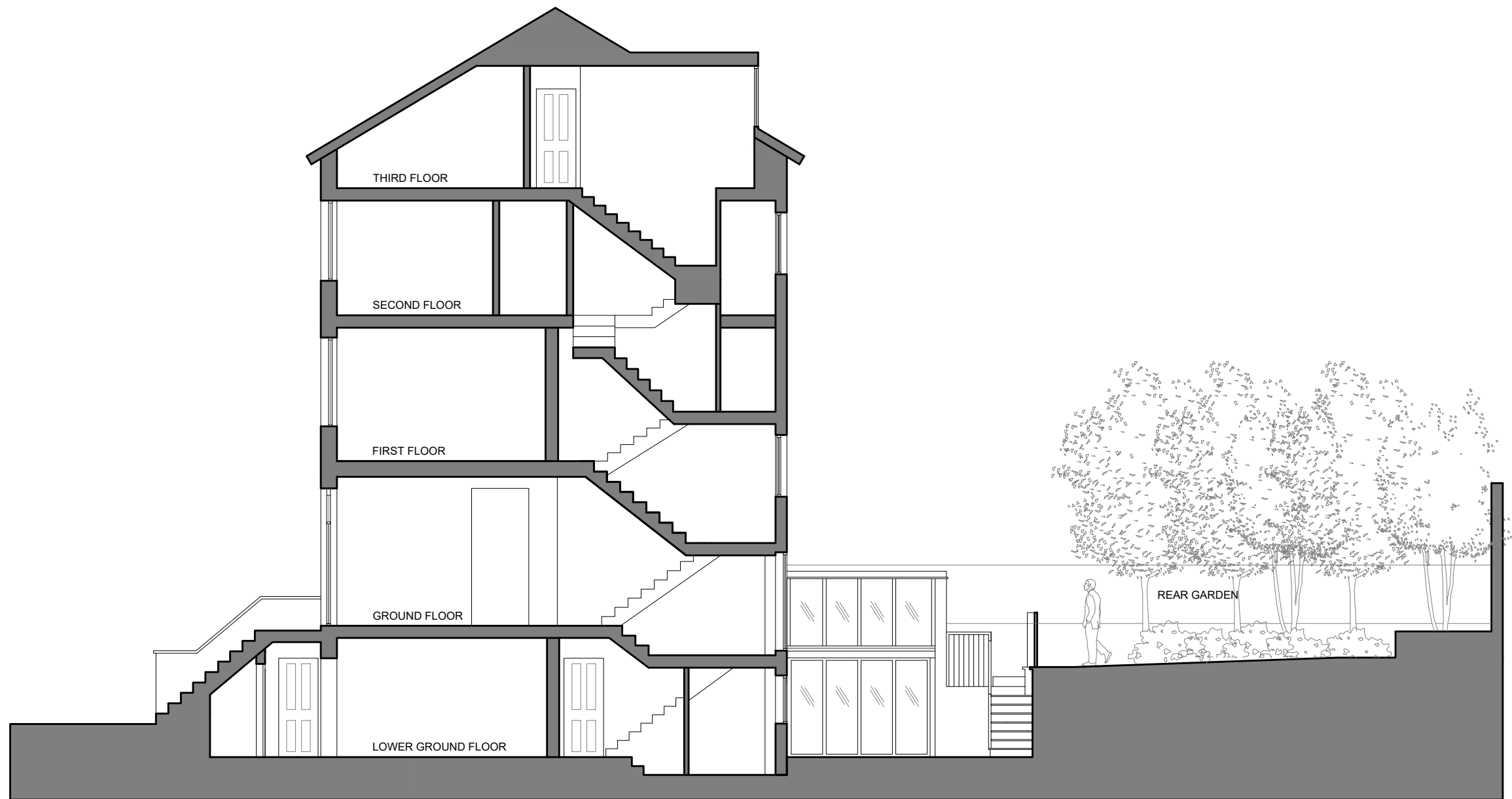
1 SECTION AA - EXISTING_ SCALE 1:100 @ A3