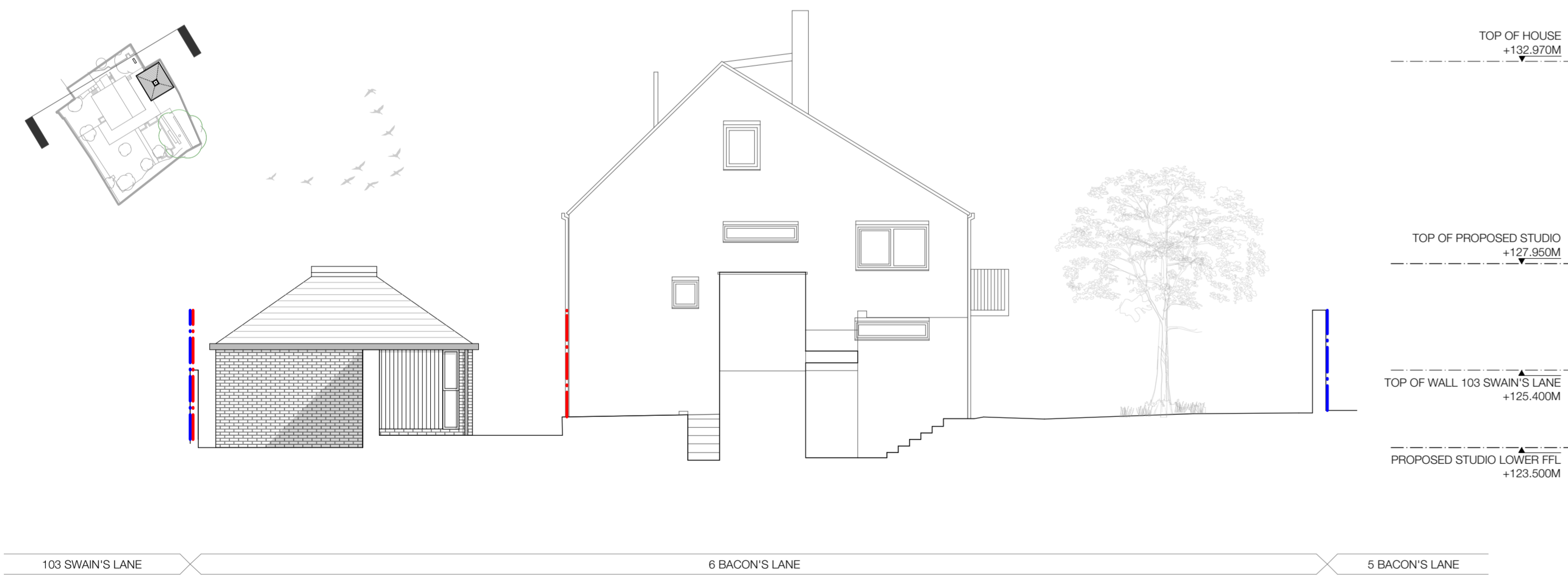
03 PROPOSED NORTH WEST ELEVATION SCALE 1:100