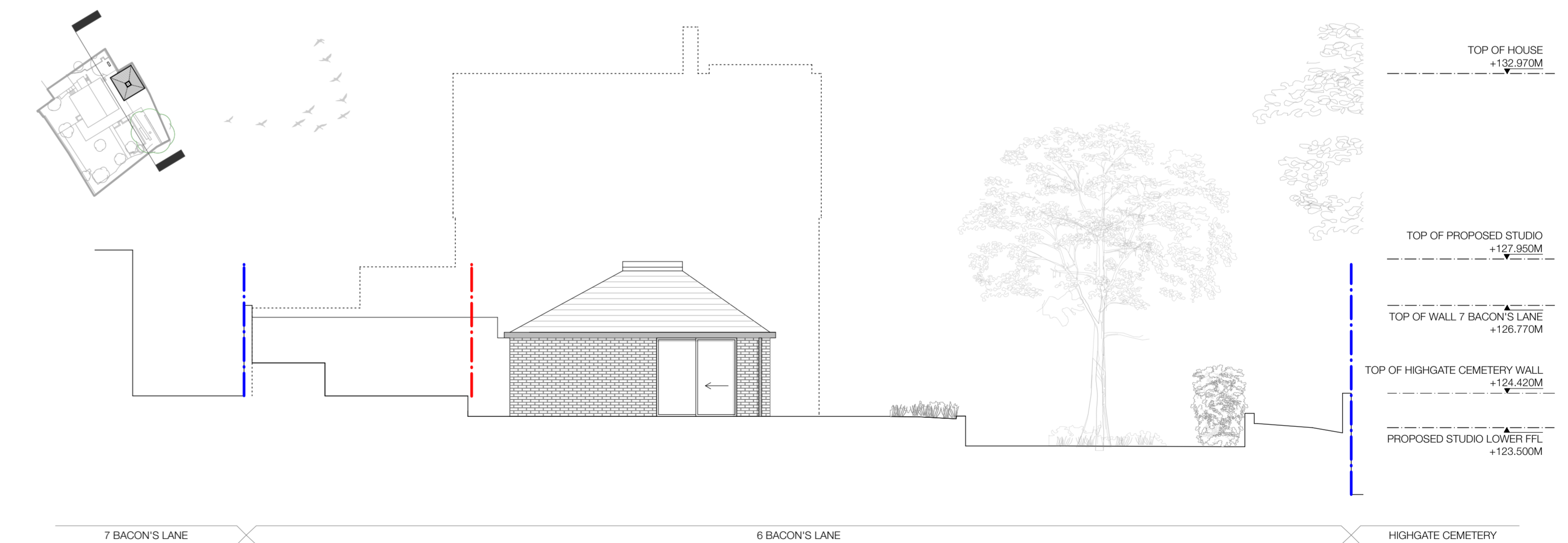
05 PROPOSED SOUTH WEST ELEVATION (SHOWING HOUSE ELEVATION BEHIND) SCALE 1:100