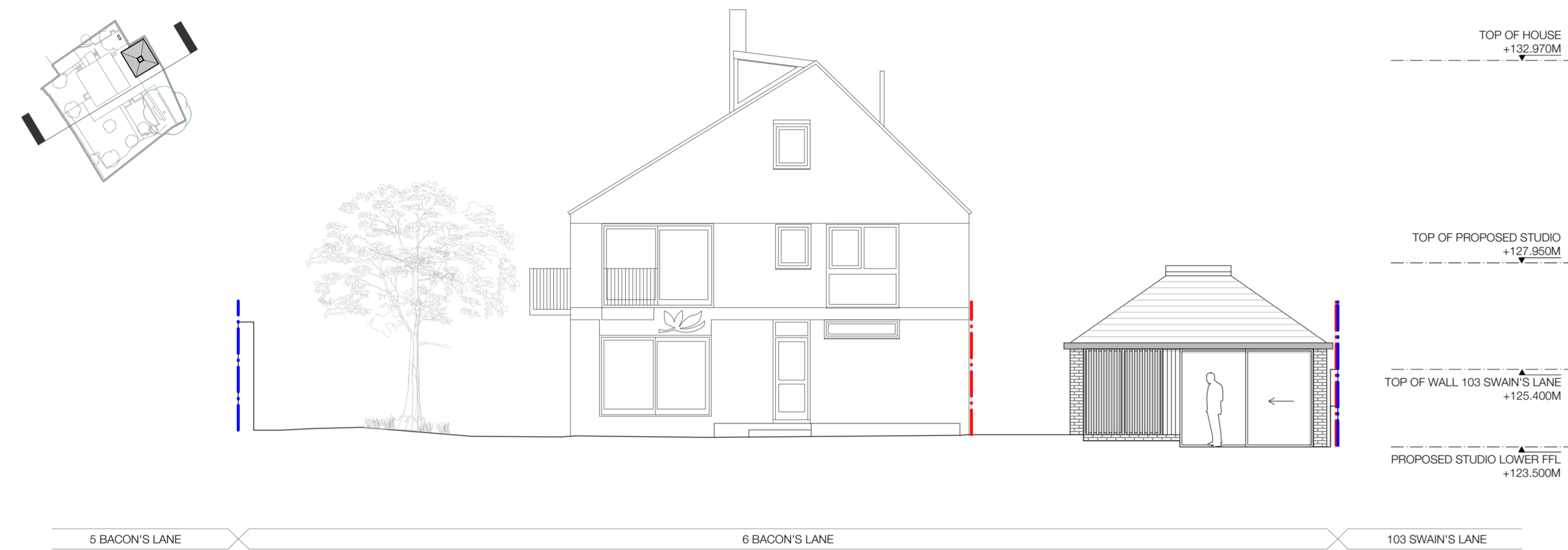
02 PROPOSED SOUTH EAST ELEVATION SCALE 1:100