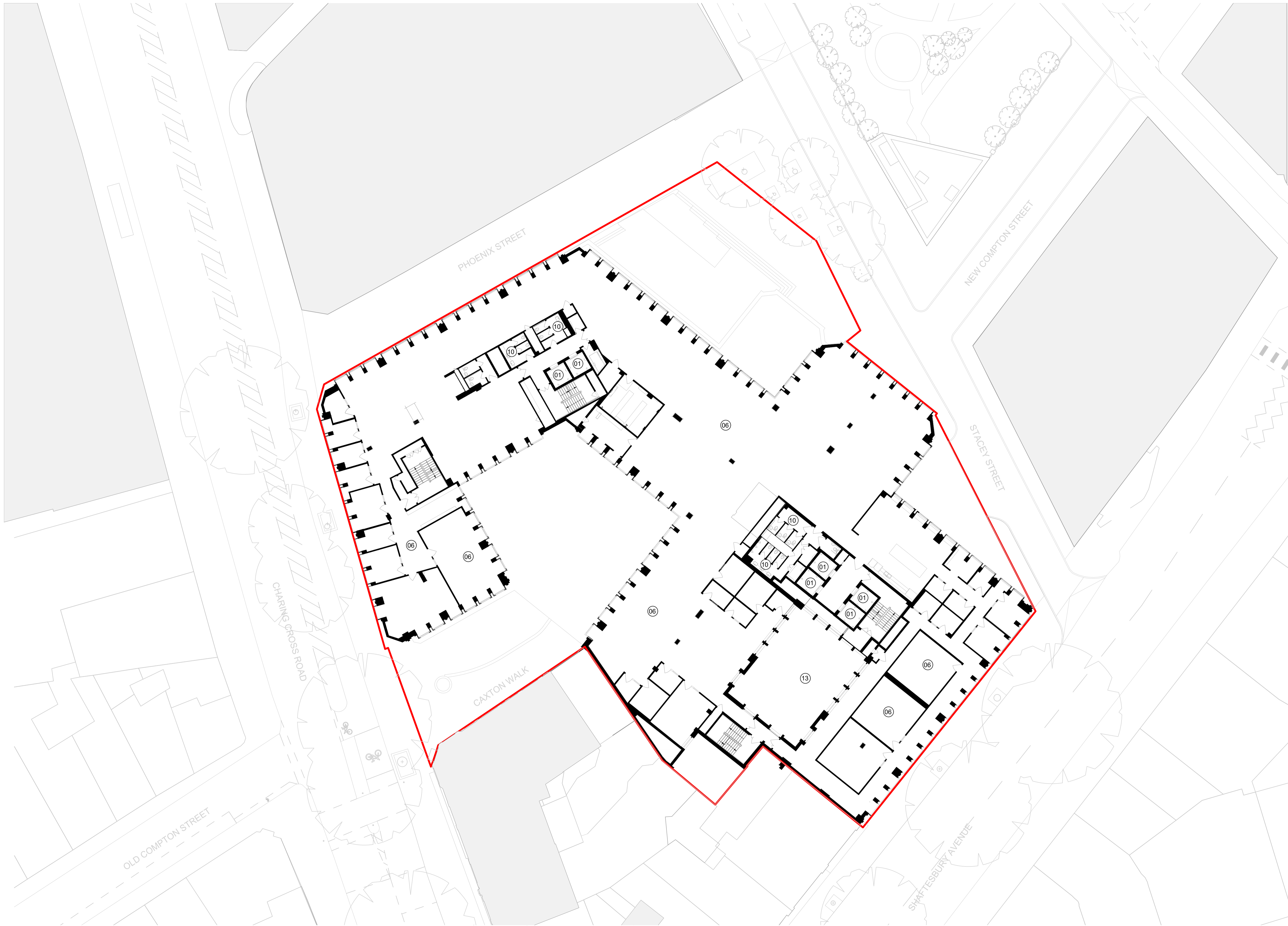
Existing Fifth Floor Plan