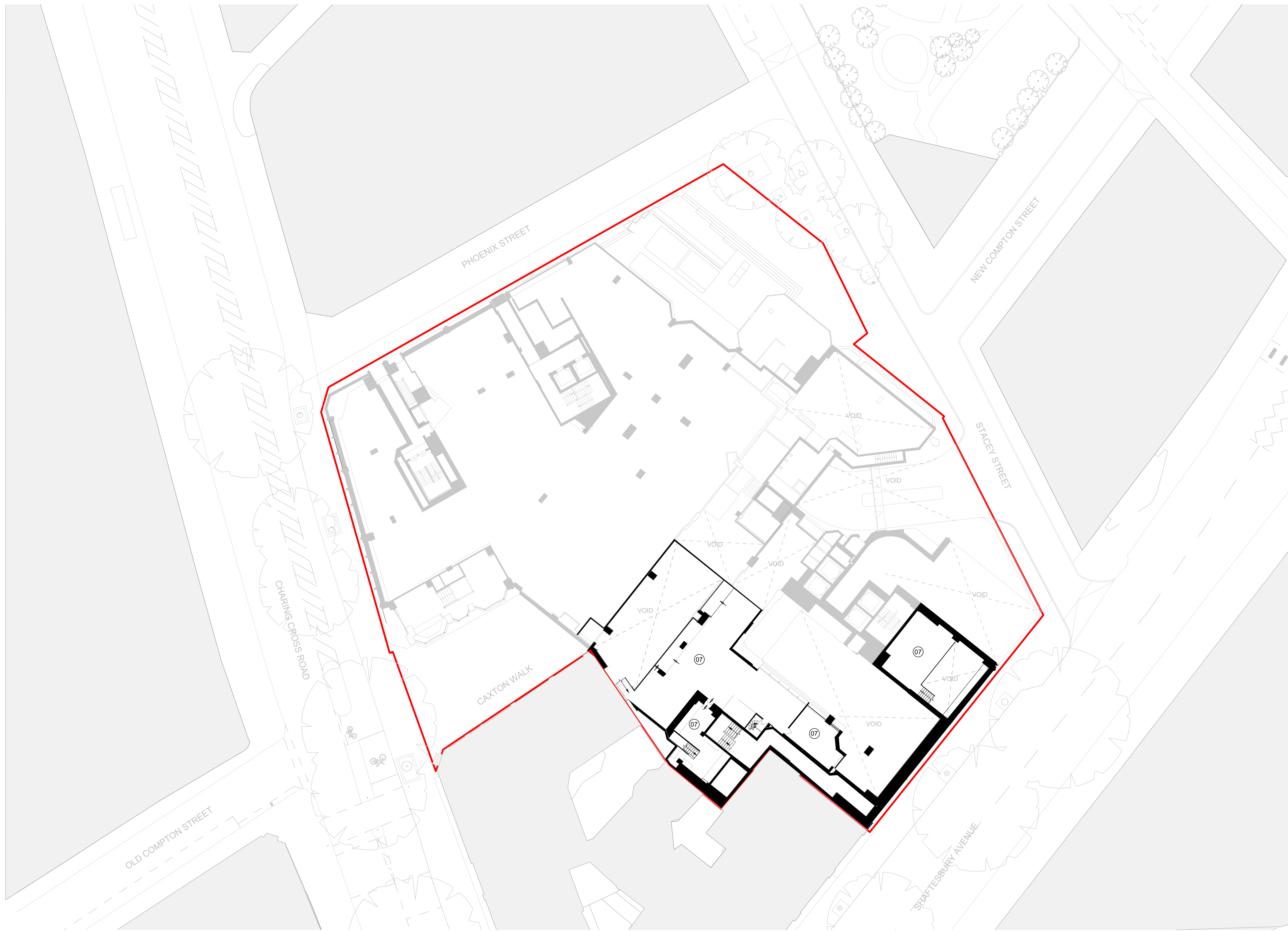
Existing Mezzanine Floor Plan