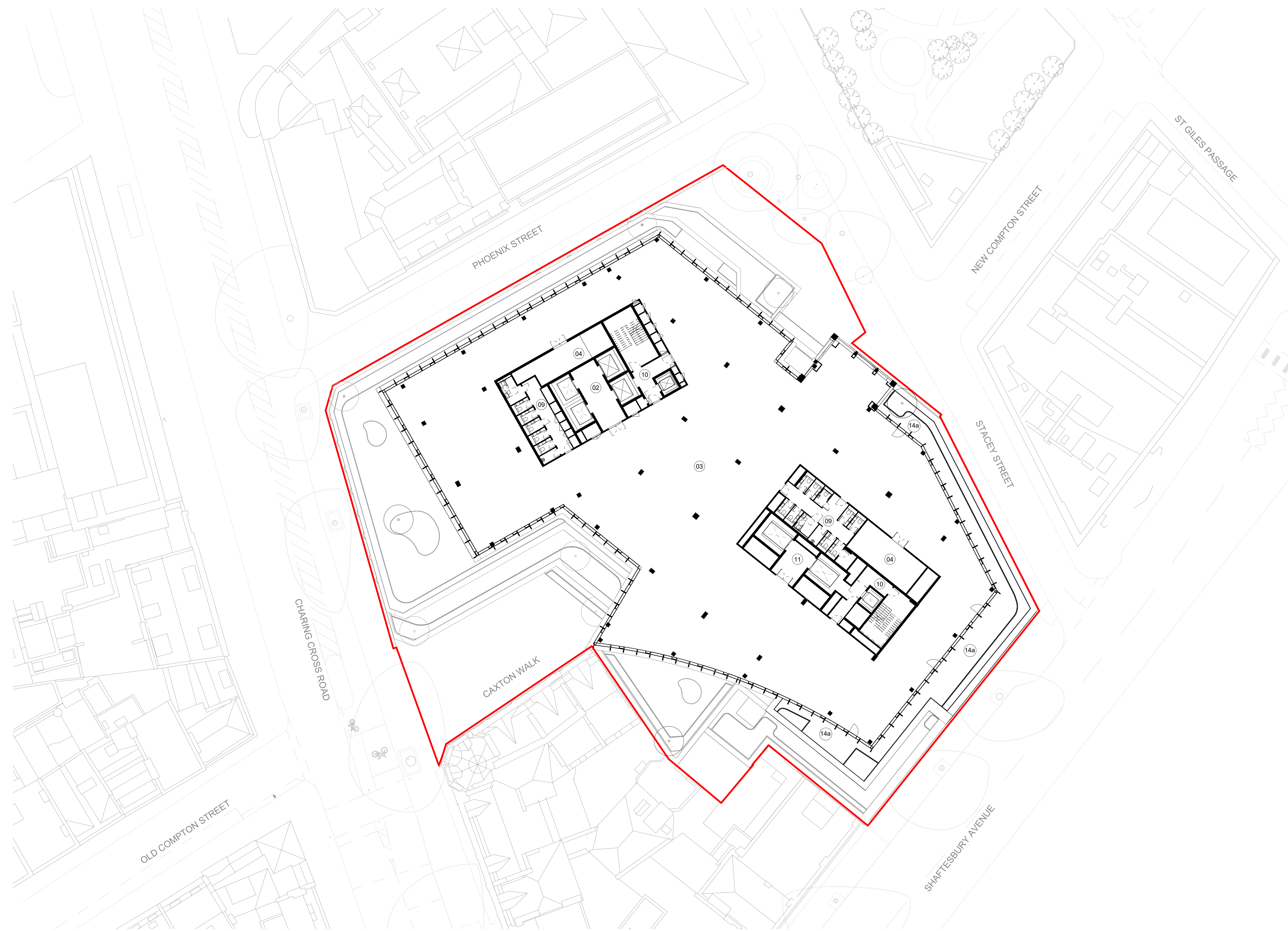
Proposed Ninth Floor Plan