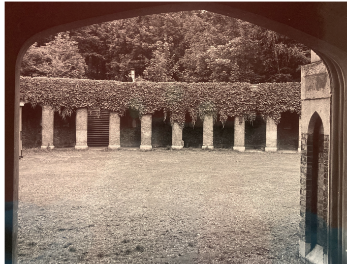
Figure 5.27 Courtyard Colonnade prior to paving works in the 1980s