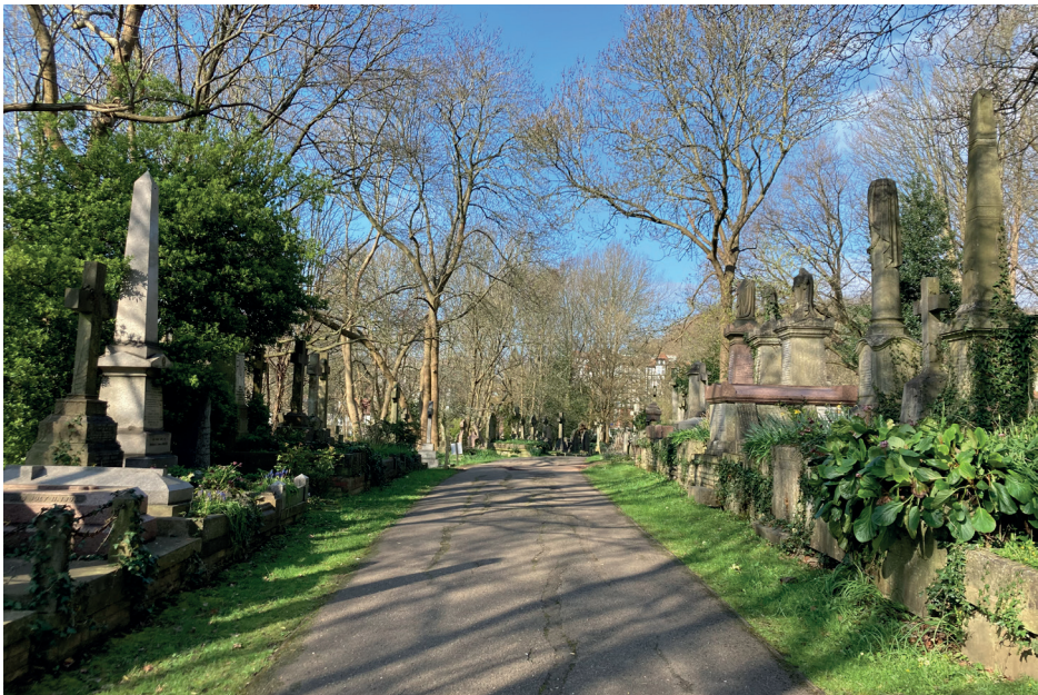
Figure 6.2 Recent photograph of Highgate Cemetery