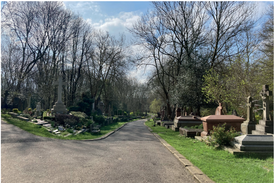
Figure 6.4 Recent photograph of Highgate Cemetery