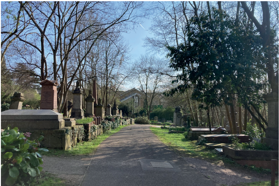
Figure 6.3 Recent photograph of Highgate Cemetery