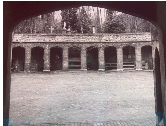
Figure 5.28 Courtyard Colonnade after paving works in the 1980s