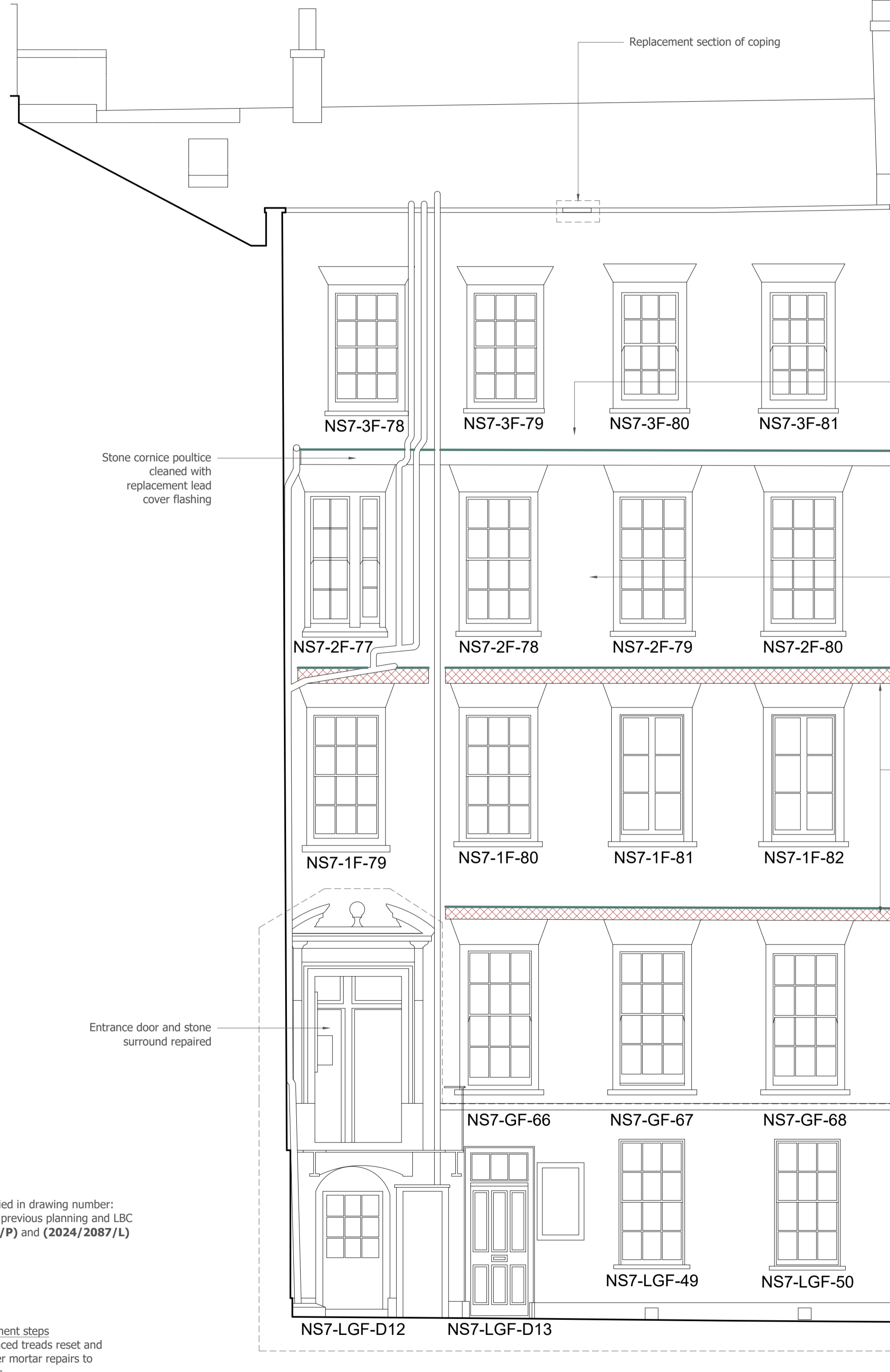
New Square No.7 1:50 Front East Elevation PROPOSED