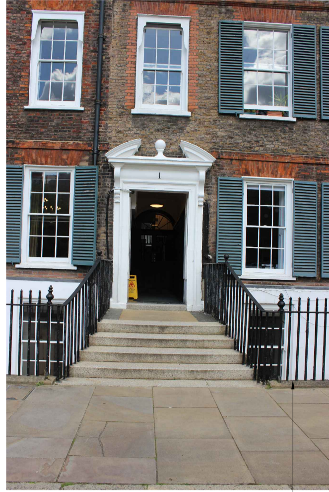
Railing repairs and redecoration. Pieced-in stone repair to damaged stone