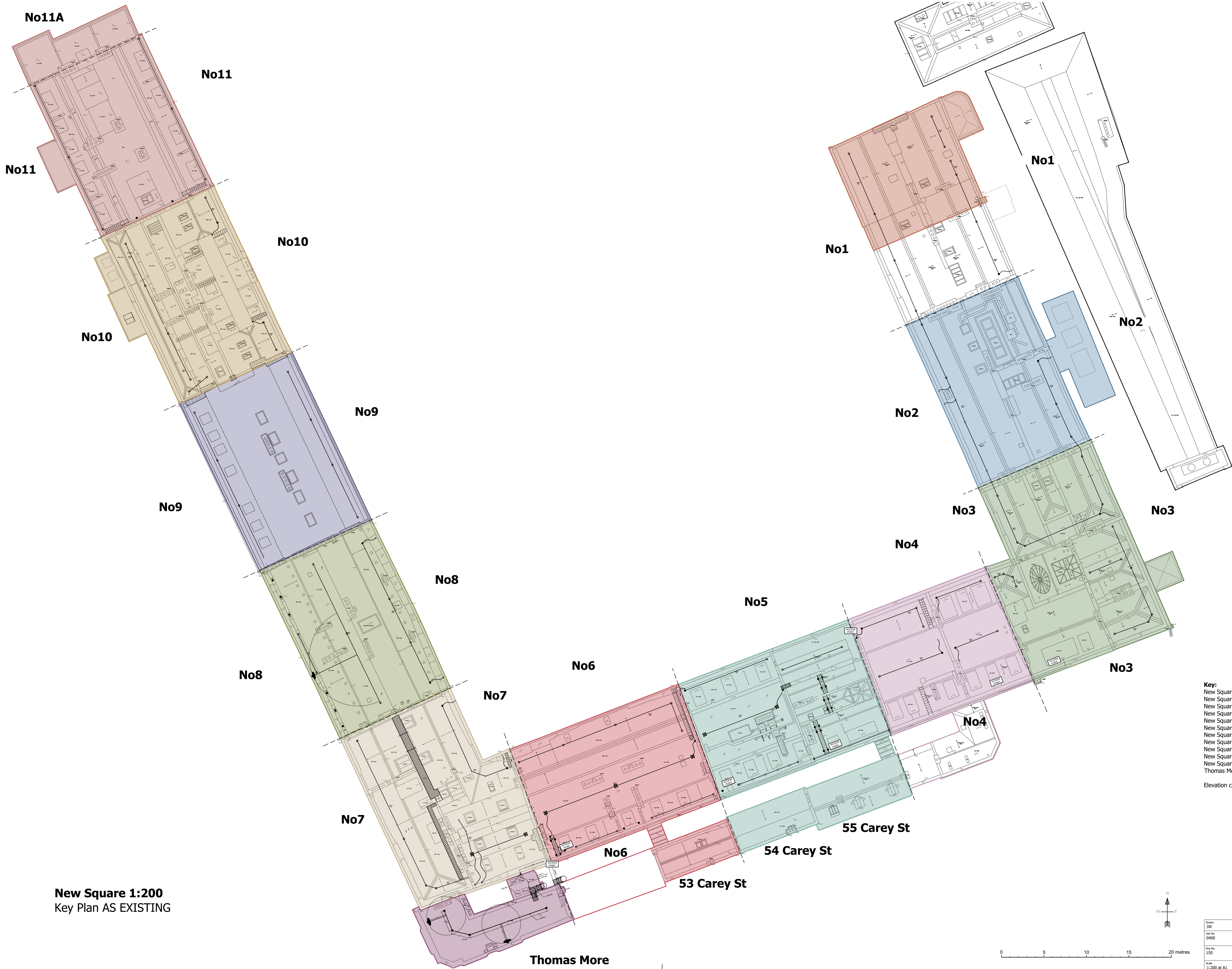
New Square 1:200 Key Plan AS EXISTING