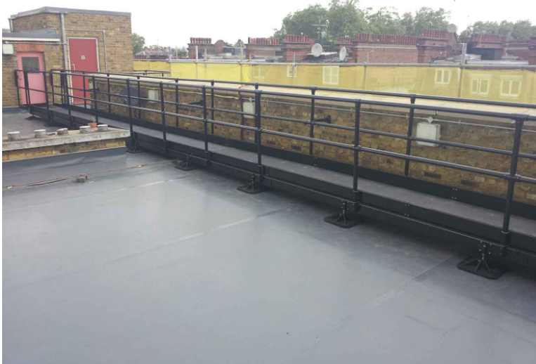
Example of Proposed Walkway