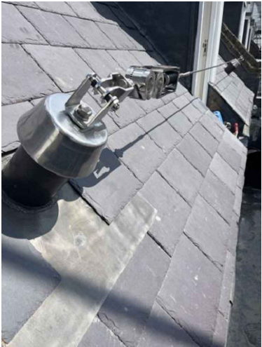
Example Images for Proposed Systems NS0038 and NS0039