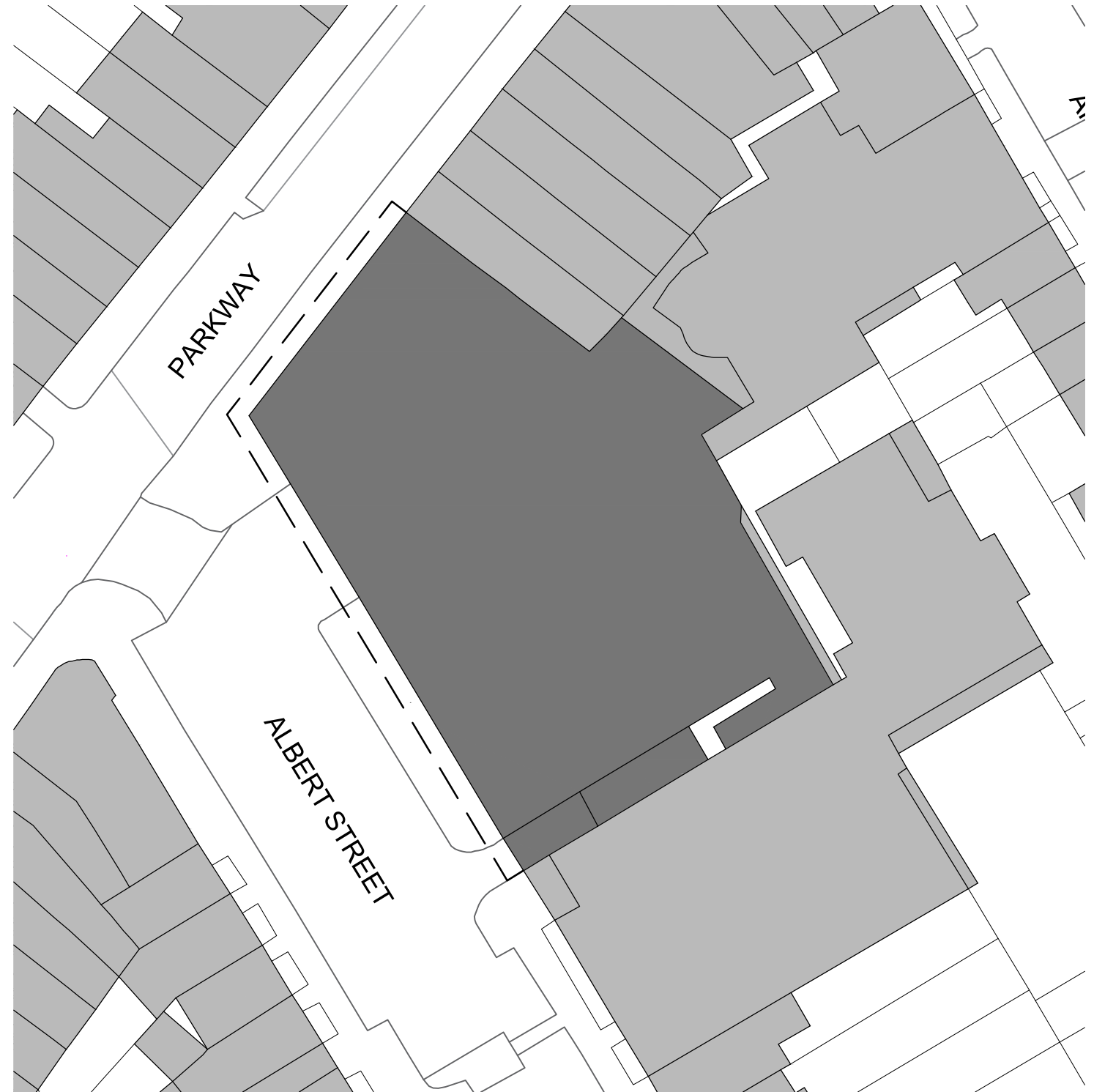
2 Site Plan - 128 Albert Street 1:500