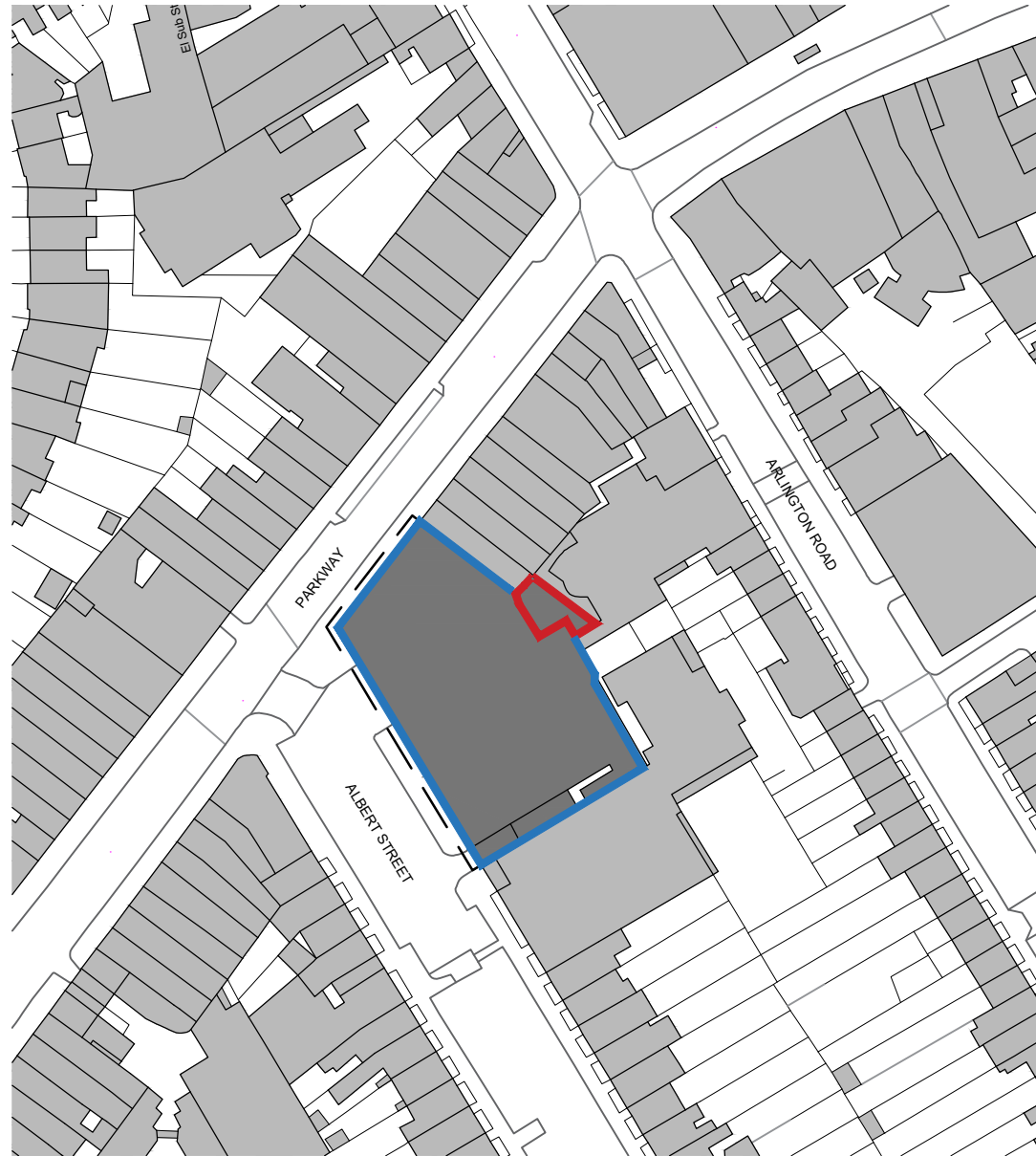
1 Location Plan - 128 Albert Street 1:1250