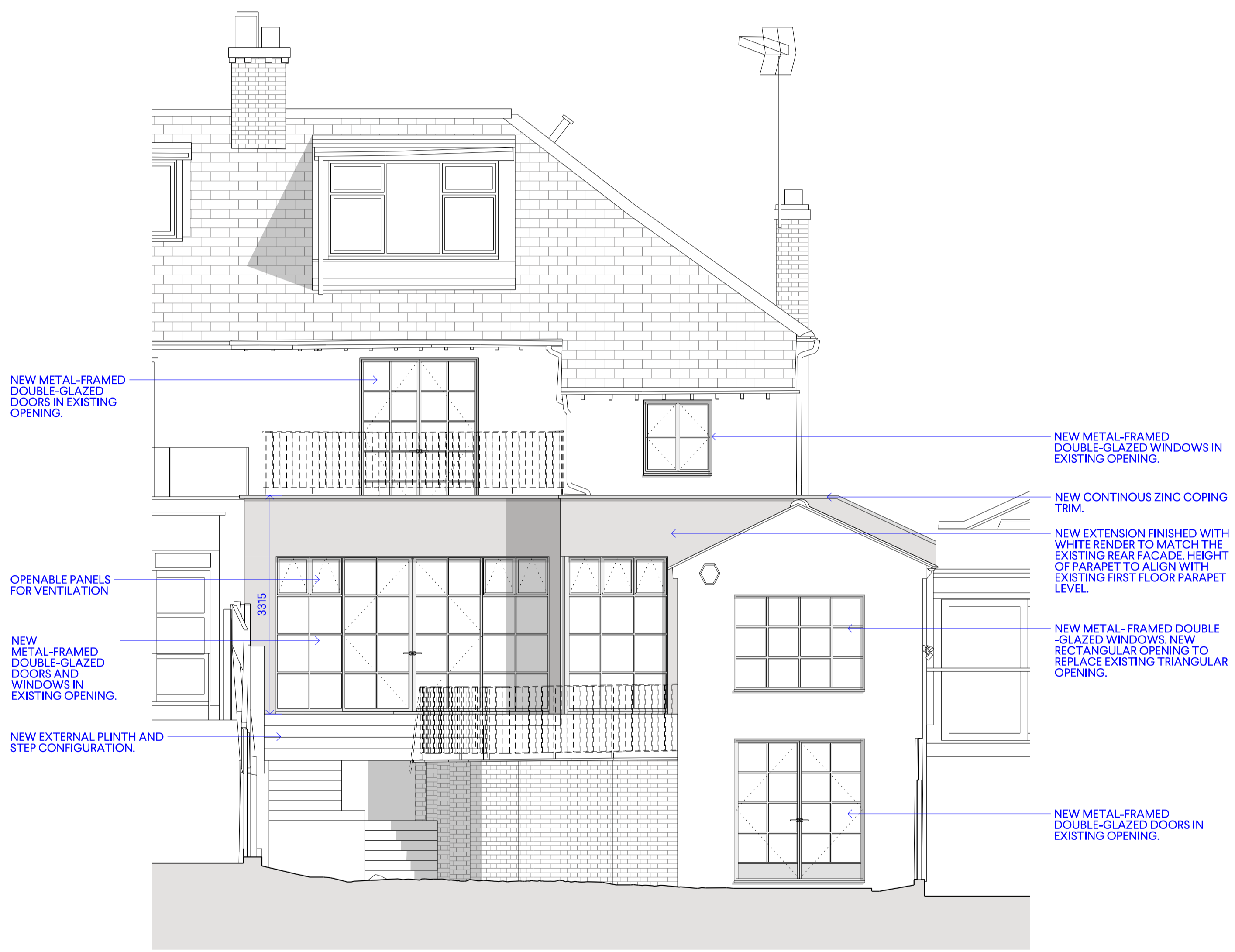
1 1:50 PROPOSED REAR ELEVATION