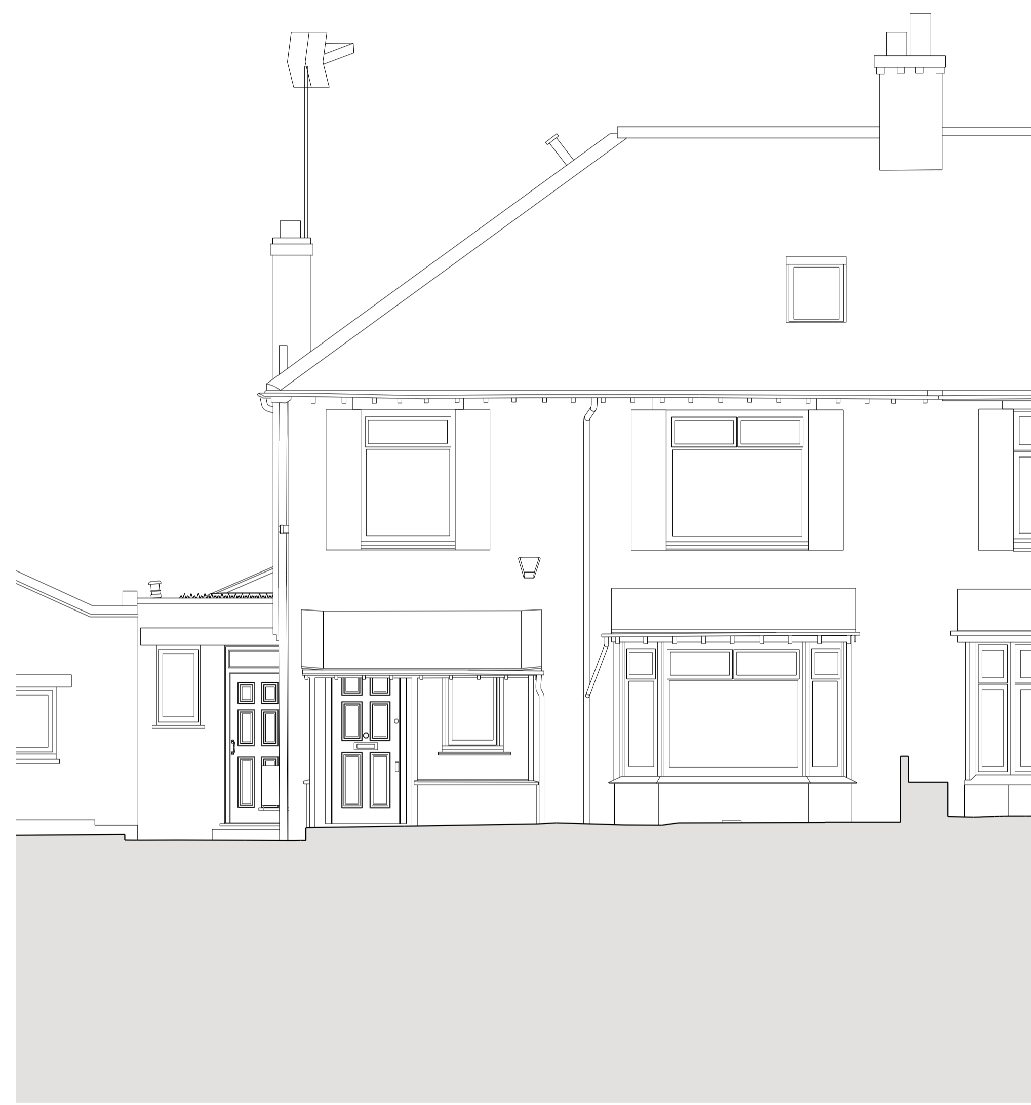
1 1:50 PROPOSED FRONT ELEVATION (NO CHANGE)