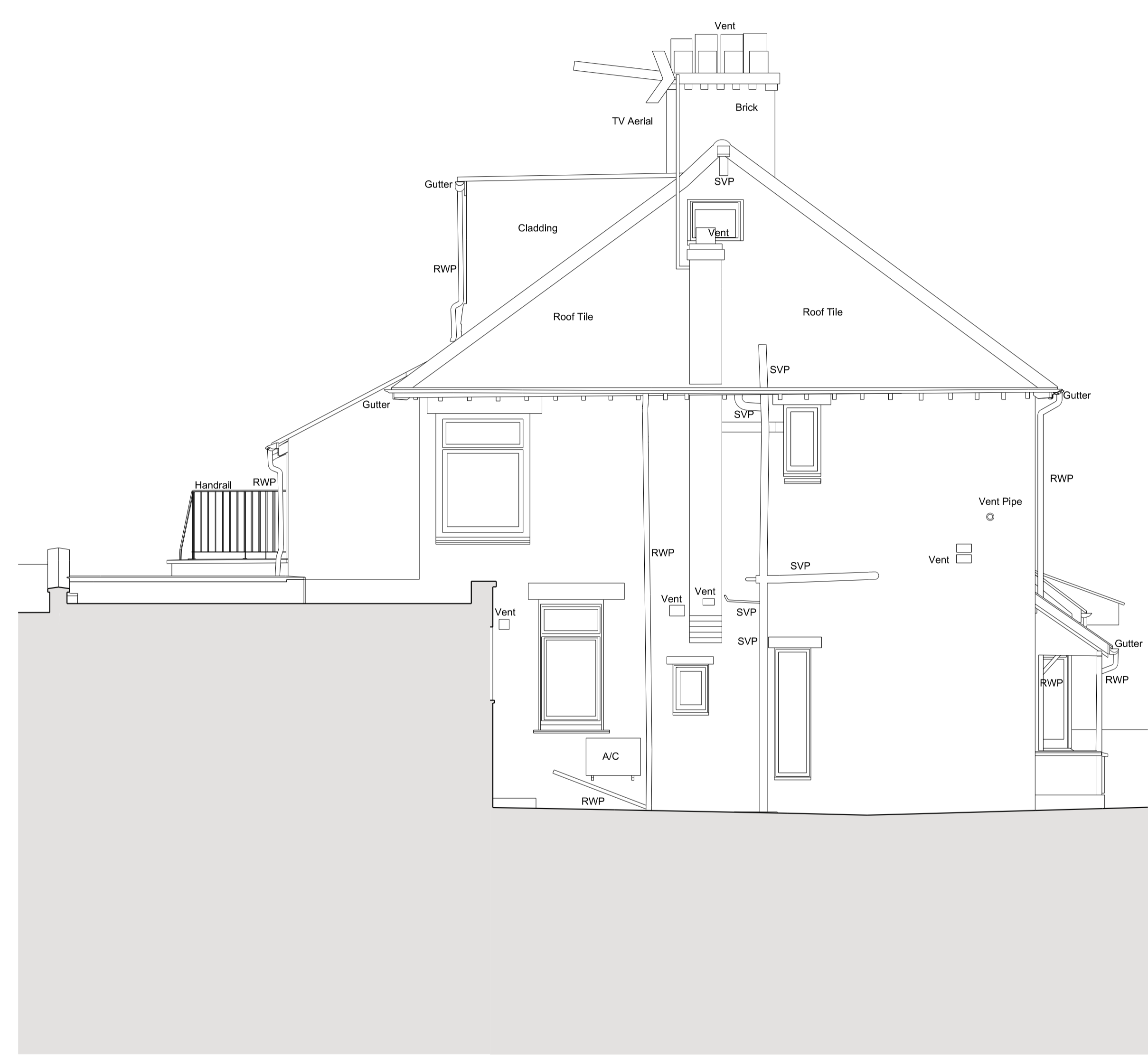
1 1:50 EXISTING SIDE ELEVATION