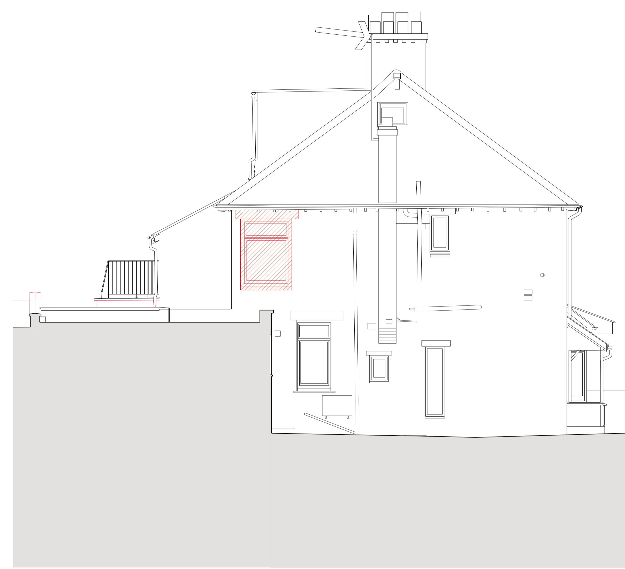
2 1:50 DEMOLITION SIDE ELEVATION