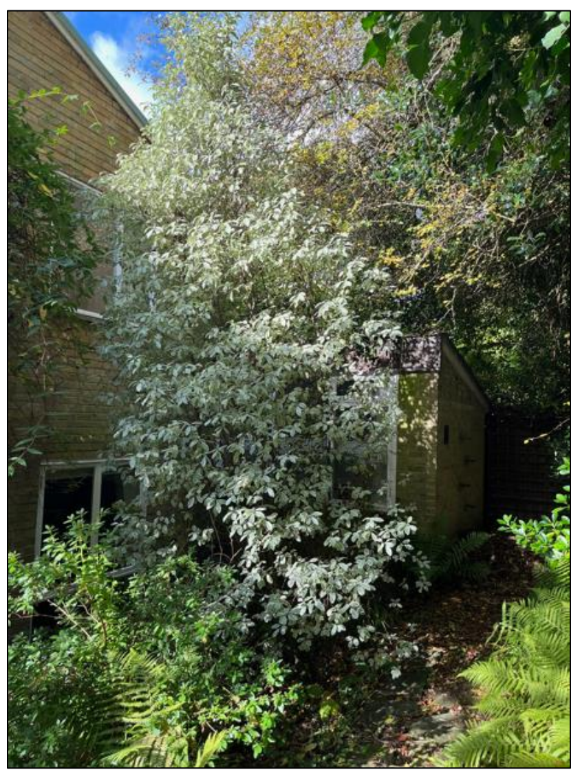
Photograph 1: Encroachment of structures

Web: www.landmarktrees.co.uk e-mail: info@landmarktrees.co.uk Tel: 0207 851 4544