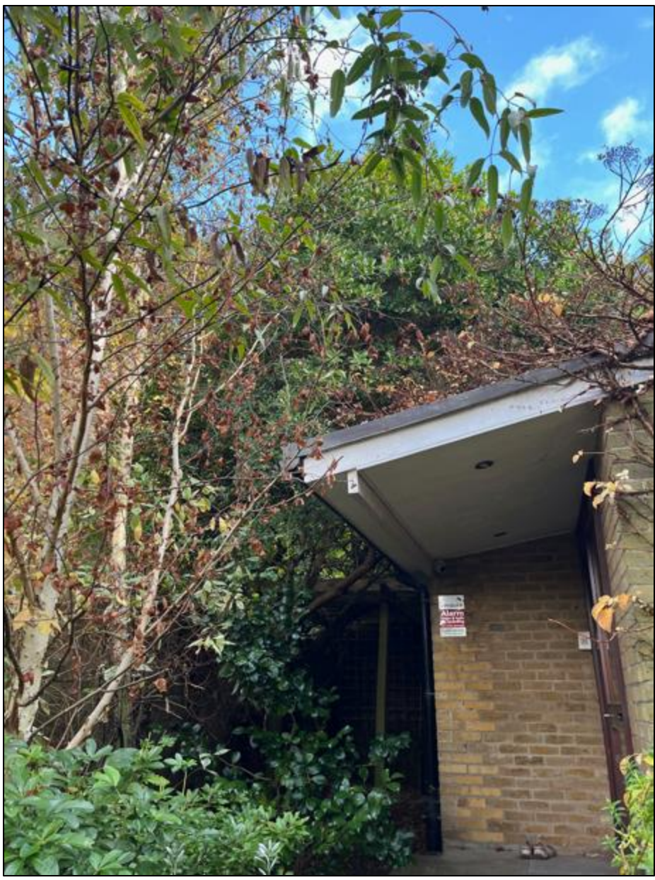
Photograph 3: T9 sprawling onto roof