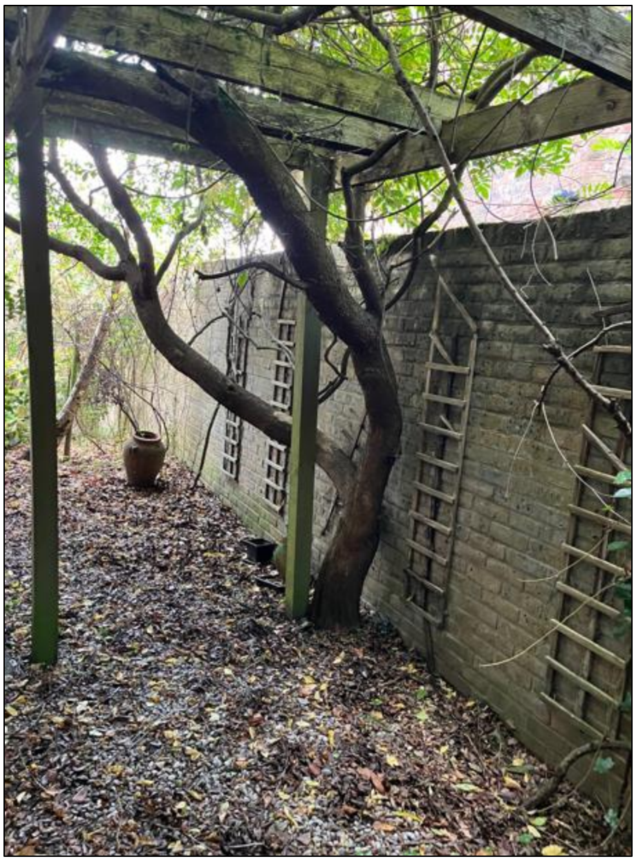
Photograph 4: Growth habit of T9