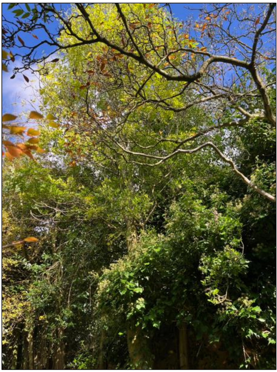
Photograph 5: Dieback in lower crown of ash T4