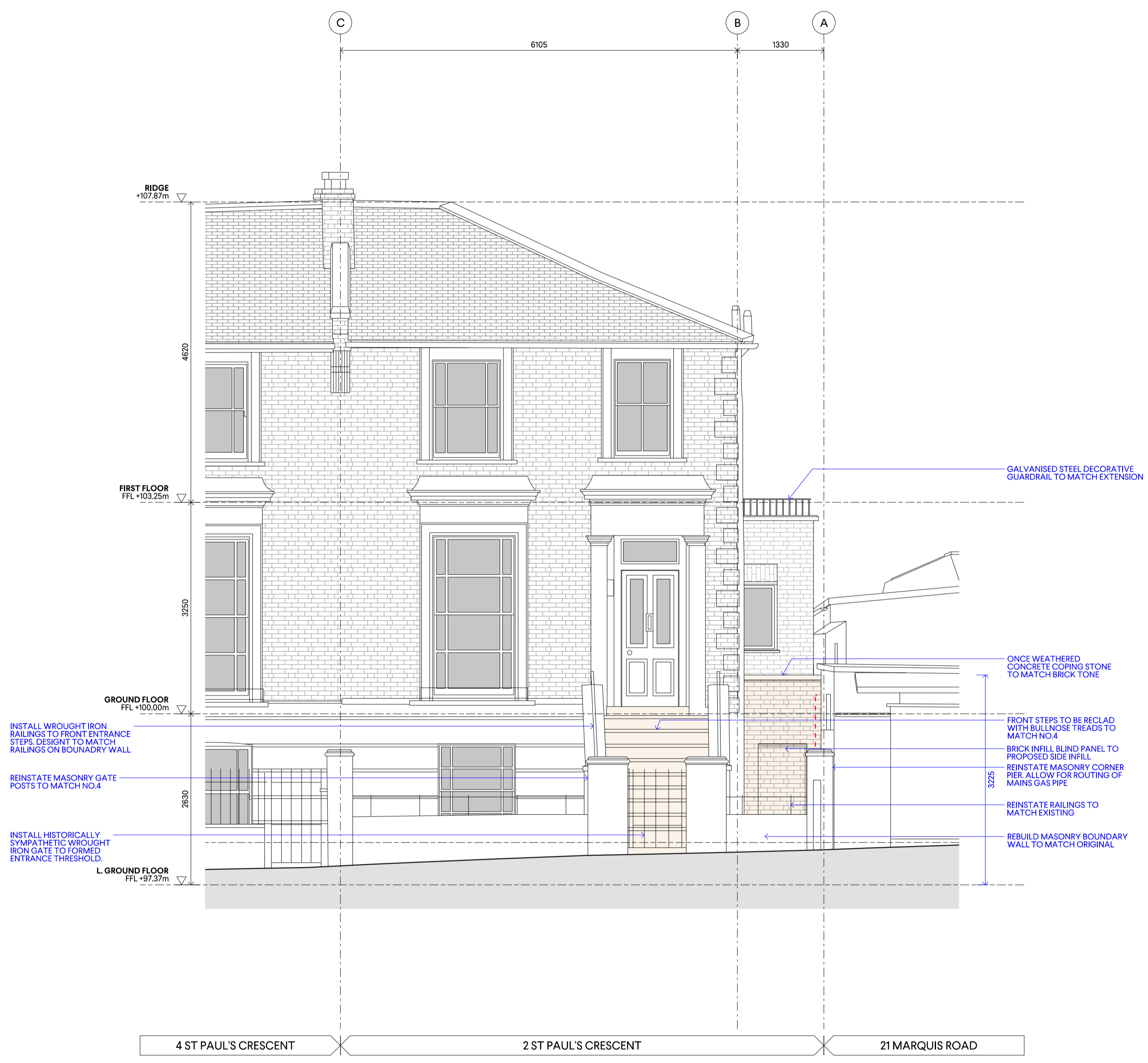
1 1:50 PROPOSED FRONT ELEVATION

DO NOT SCALE OFF THIS DRAWING. DIMENSIONS, AREA AND LEVELS ARE ONLY APPROXIMATE AND SUBJECT TO SITE SURVEY. ALL DIMENSIONS TO BE CHECKED ON SITE. ANY DISCREPANCIES OR VARIATIONS TO BE REPORTED TO THE ARCHITECT BEFORE WORK COMMENCES. THIS DRAWING TO BE READ IN CONJUNCTION WITH THE SPECIFICATION, WHERE PROVIDED, AND ALL RELEVANT CONSULTANTS DRAWINGS AND/OR SPECIFIC DRAWINGS DOCUMENTS AND ANY DISCREPANCIES OR VARIATIONS ARE TO BE REPORTED TO THE ARCHITECT BEFORE THE AFFECTED WORK COMMENCES. THIS DRAWING IS PROTECTED BY COPYRIGHT, AND MUST NOT BE COPIED OR REPRODUCED WITHOUT THE WRITTEN CONSENT OF HOD ARCHITECTS LTD. NORTH POINTS SHOWN ARE INDICATIVE. ©