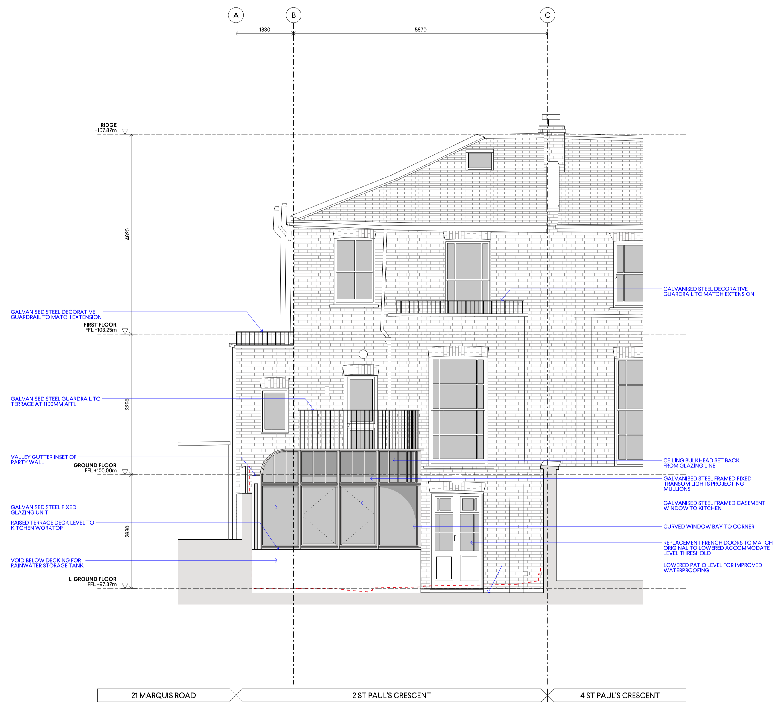
2 1:50 PROPOSED REAR ELEVATION