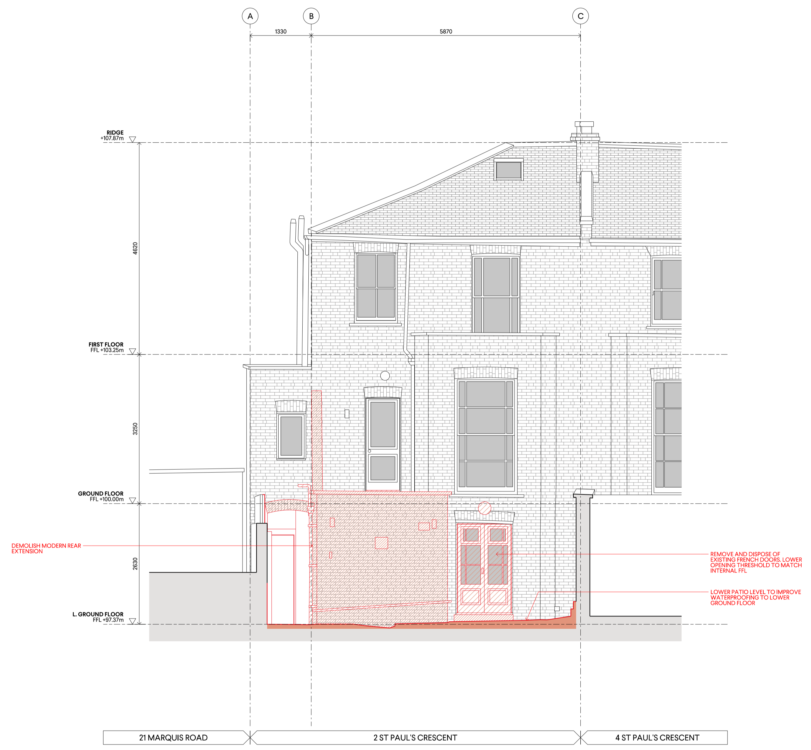
2 1:50 DEMOLITION REAR ELEVATION