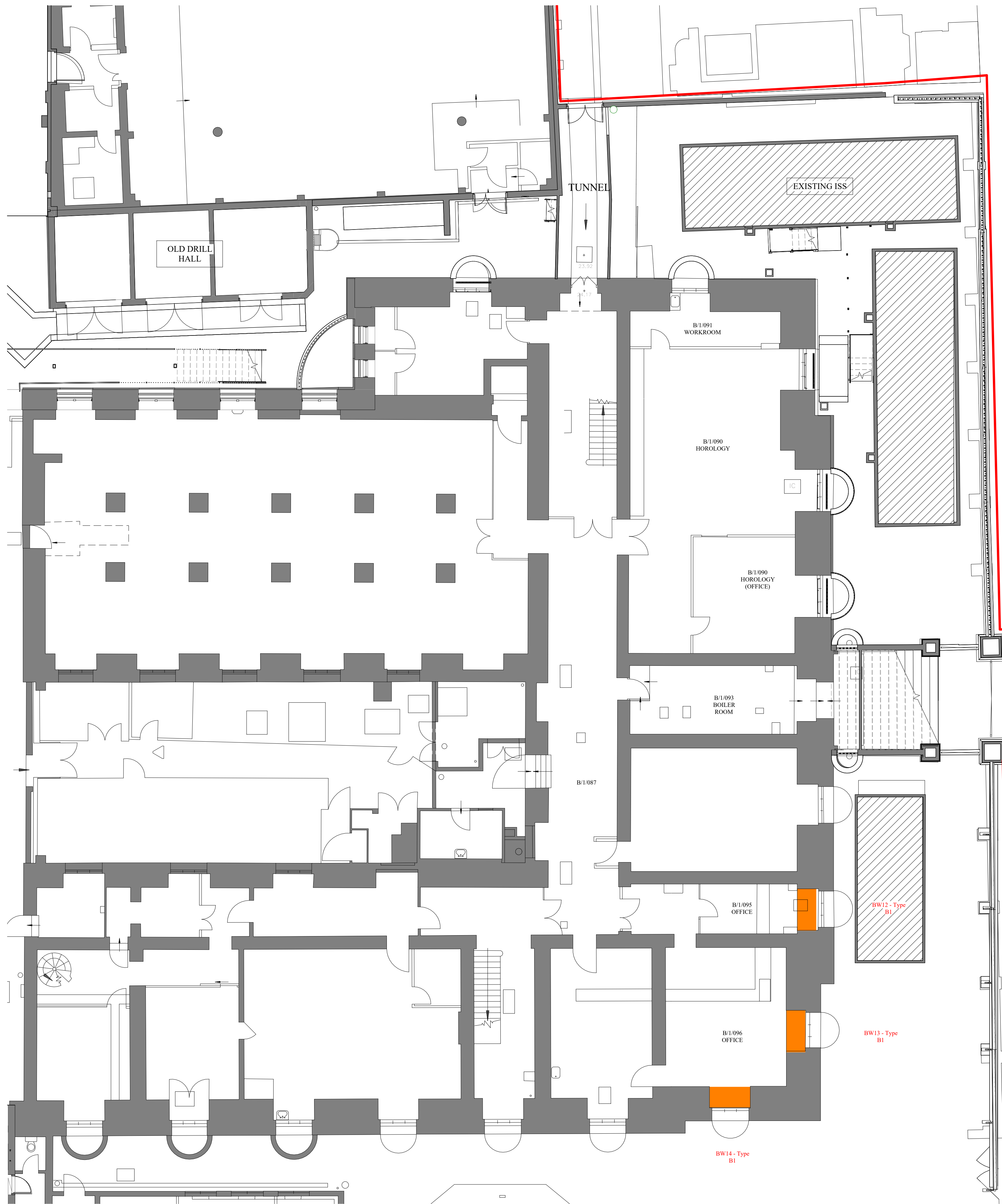
1 L01 - Sector B (White Wing) Additional horology scope 1 : 100