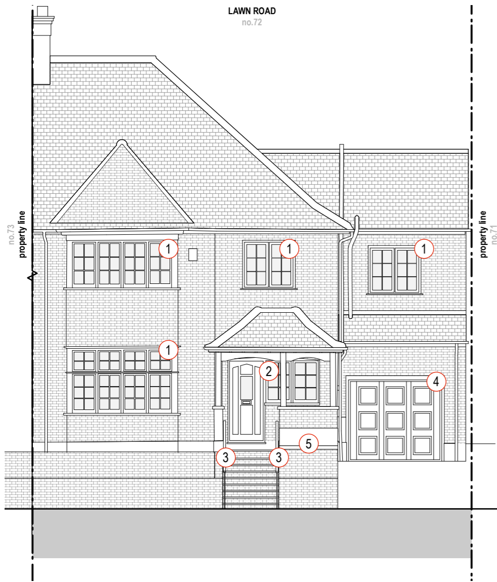
Proposed Elevation - Front / Street 1:100