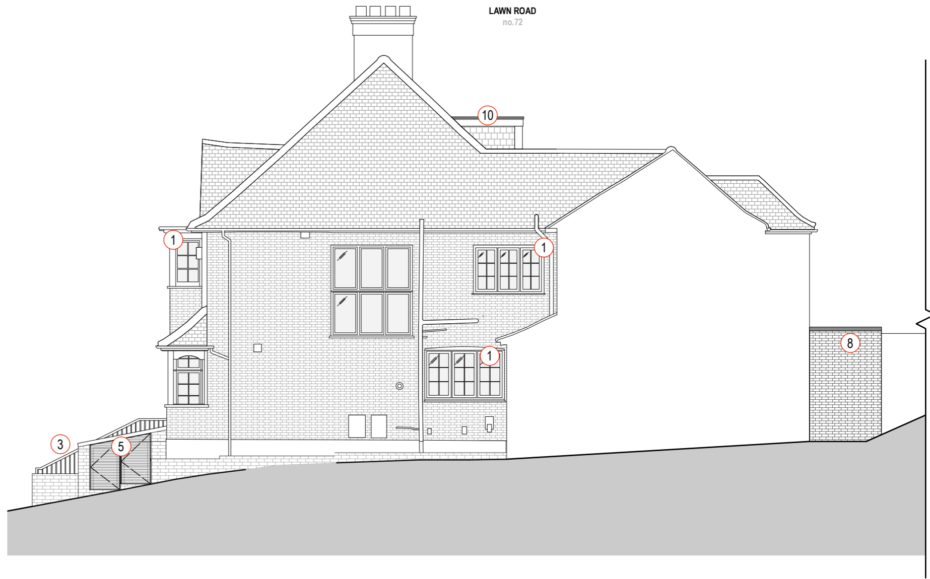
Proposed Elevation - Side (North) 1:100