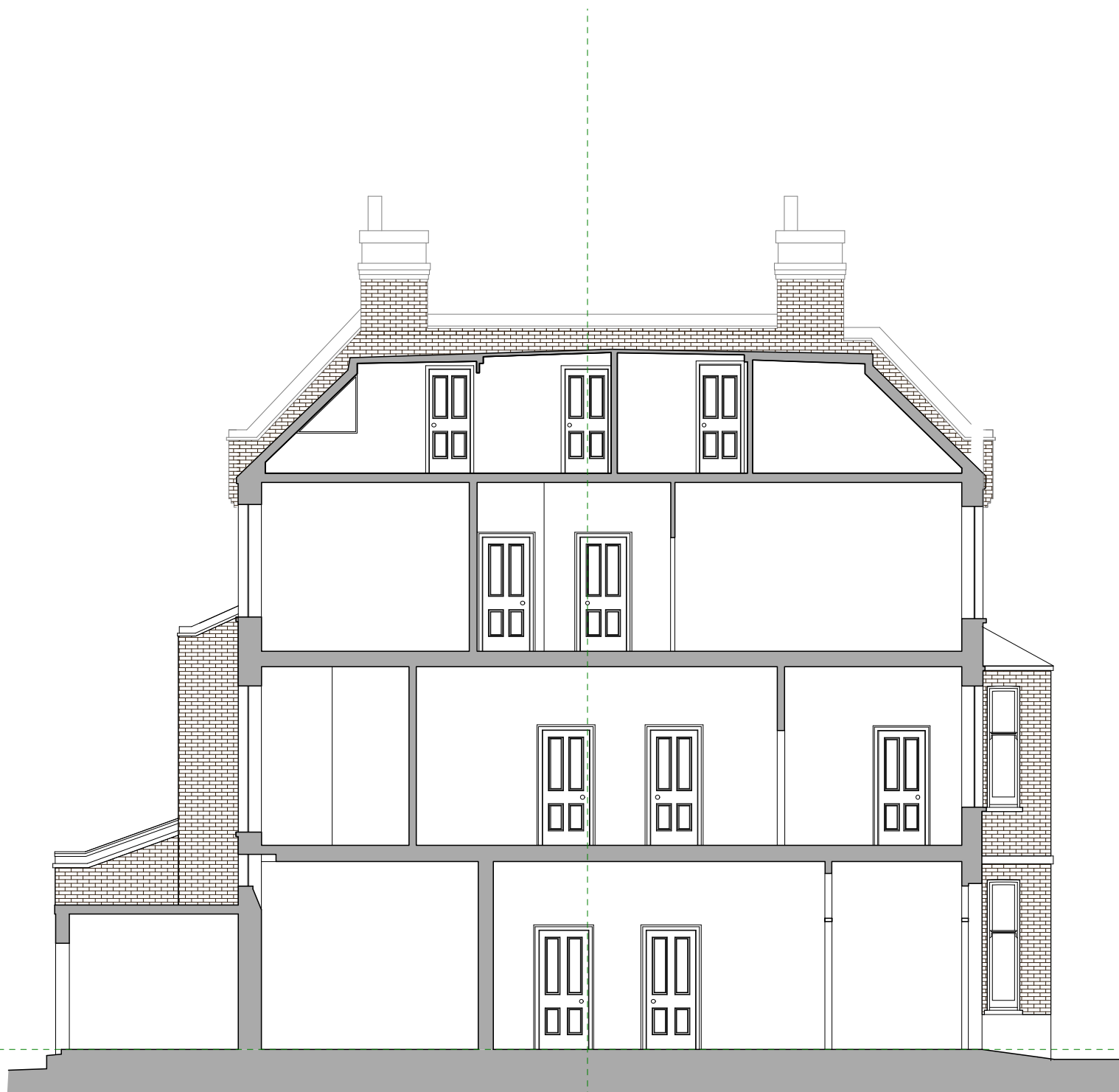
11 SECTION BB Scale: 1:100