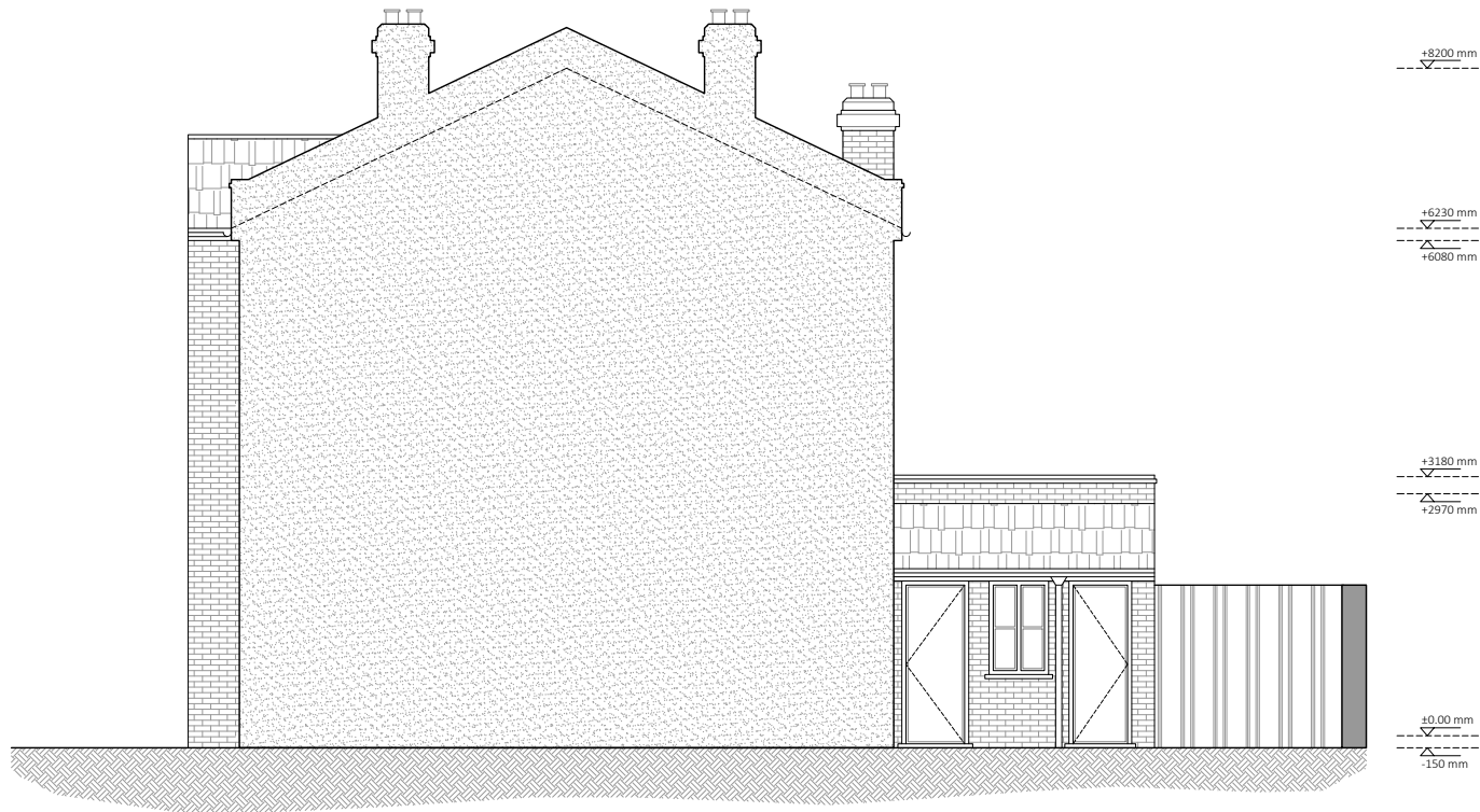
EXISTING SOUTHWEST SIDE ELEVATION