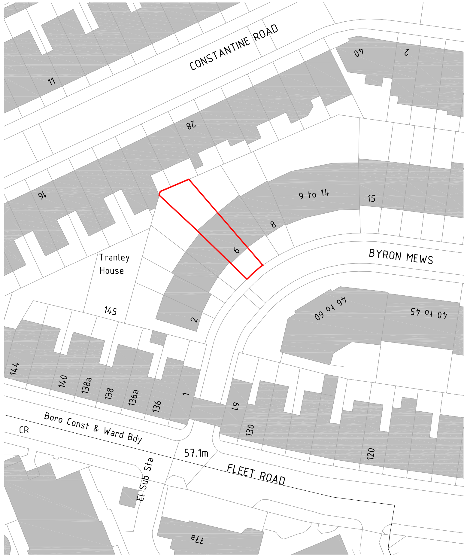
BLOCK PLAN scale 1:500