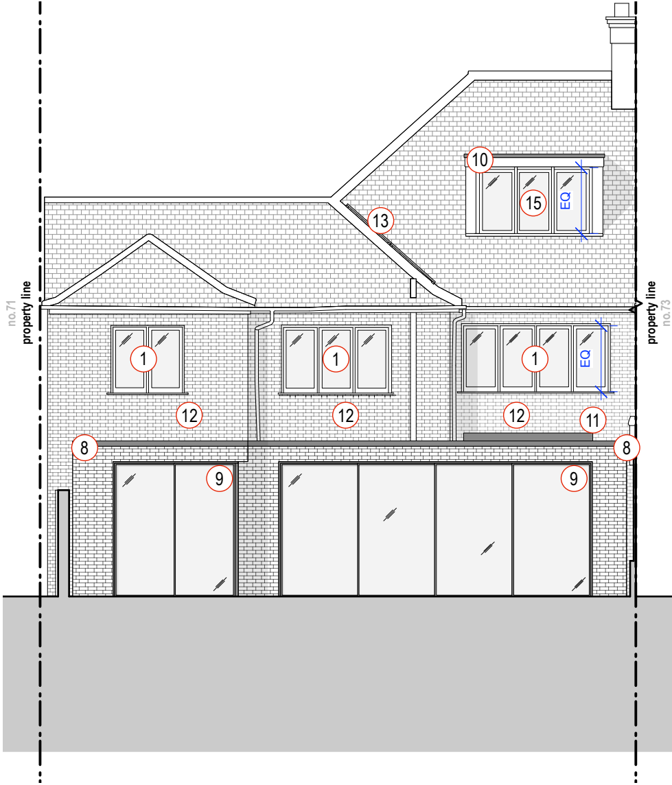
Proposed Elevation - Rear