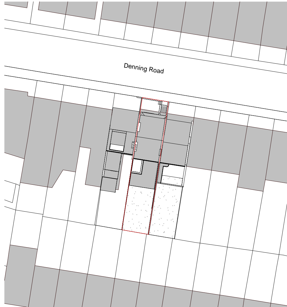
Site Plan 1:500