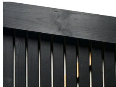
Black Painted slats with 6mm gaps