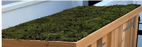
Sedum Green Roof