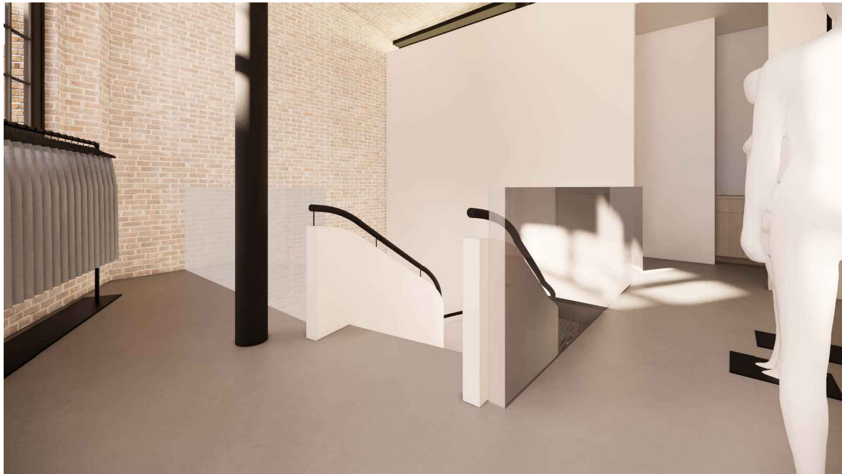
4 FIRST FLOOR NTS

Written dimensions on these drawings shall take precedence over scaled dimensions. Contractors shall verify and be responsible for all dimensions and conditions on the project and this office must be notified of any variations from the dimensions and conditions shown by these drawings prior to commencement of any work. All contractors are deemed to have made themselves aware of site conditions prior to entering into any contract. Shopfitting details must be submitted to this office for approval before proceeding with fabrication. This drawing is the property of rpa. Copyright is reserved by them and the drawing is issued on condition that it is not copied, reproduced, retained or disclosed to any unauthorised person, either wholly or in part without the consent in writing of rpa.