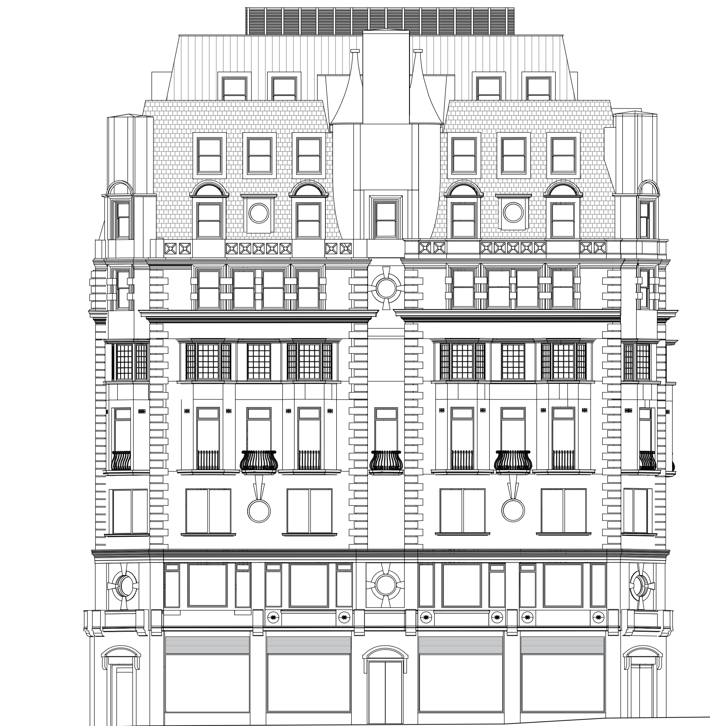
02 Elevation 02