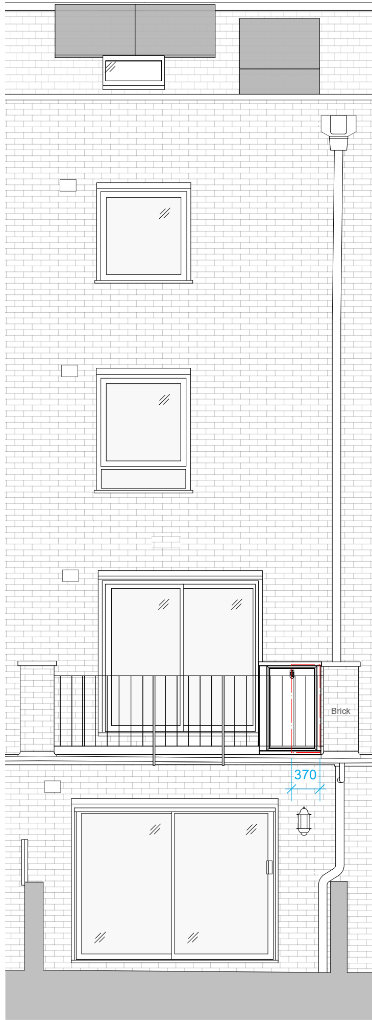
6 Elevation 02 - Rear Scale: 1:50

© This drawing is the property of Miltiadou Cook Mitzman architects. No disclosure or copy of it may be made without the written permission of Miltiadou Cook Mitzman architects. For construction purposes: - Do not scale this drawing. - All dimensions and levels to be checked on site. - Discrepancies to be reported to Miltiadou Cook Mitzman architects before proceeding. - If in any doubt about information on this drawing contact Miltiadou Cook Mitzman architects.