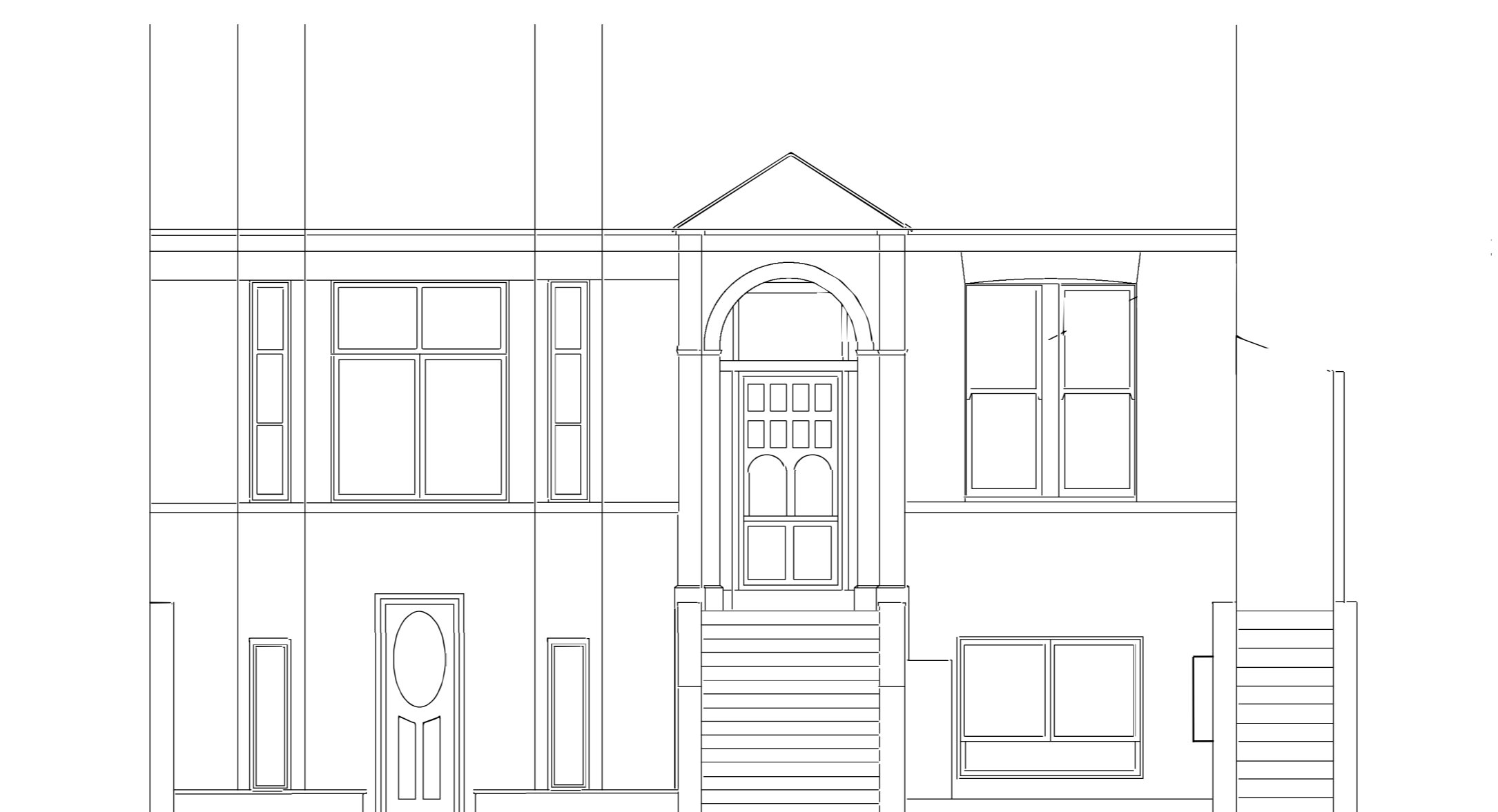
FRONT ELEVATION TO FINCHLEY ROAD

Date: 10/10/2024 TITLE: EXISTING PLANS AND FRONT ELEVATION TO 226A FINCHLEY ROAD Scale: 1:50 (A1) 1:100 (A3) DRAWING: PROPOSED PLANS & FRONT ELEVATION