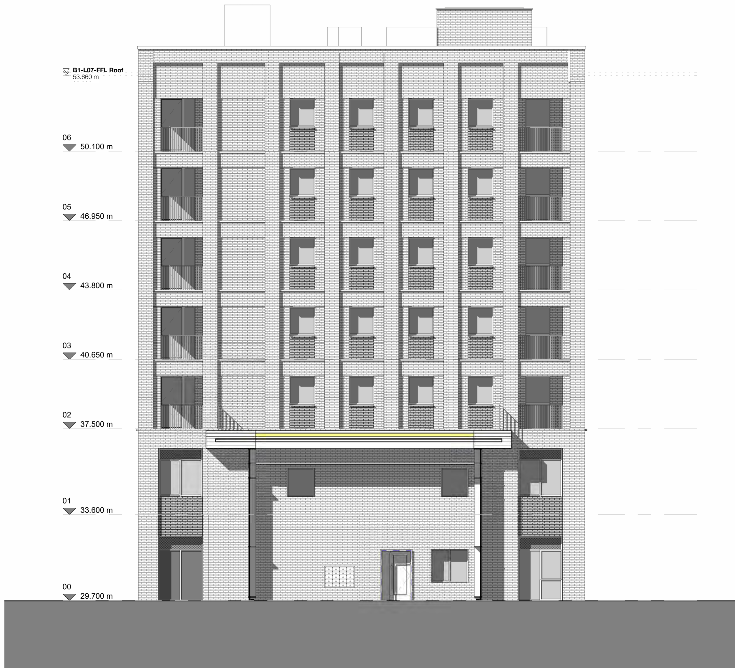
2 Internal Elevation East 1 : 100