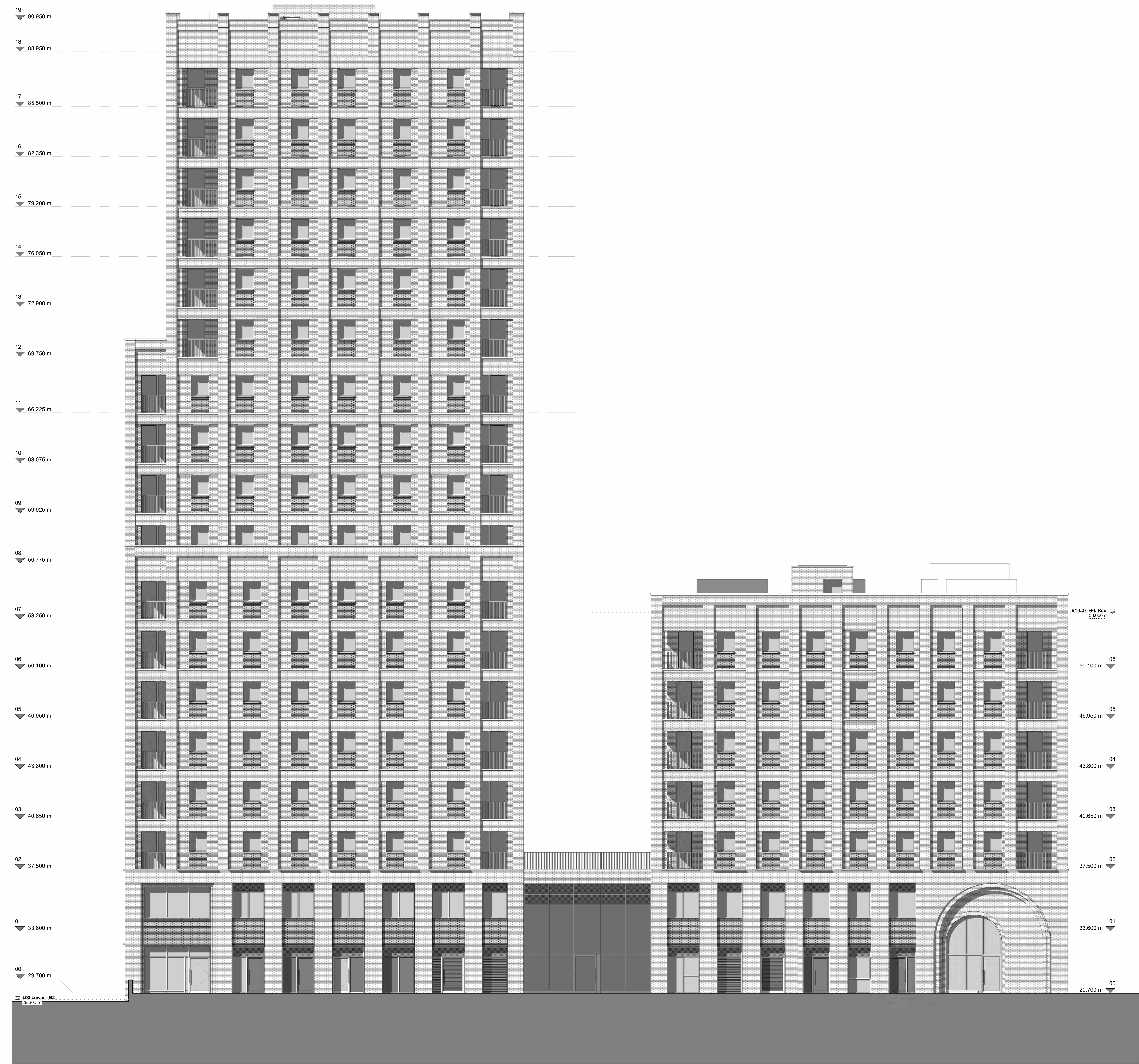
1 North Elevation