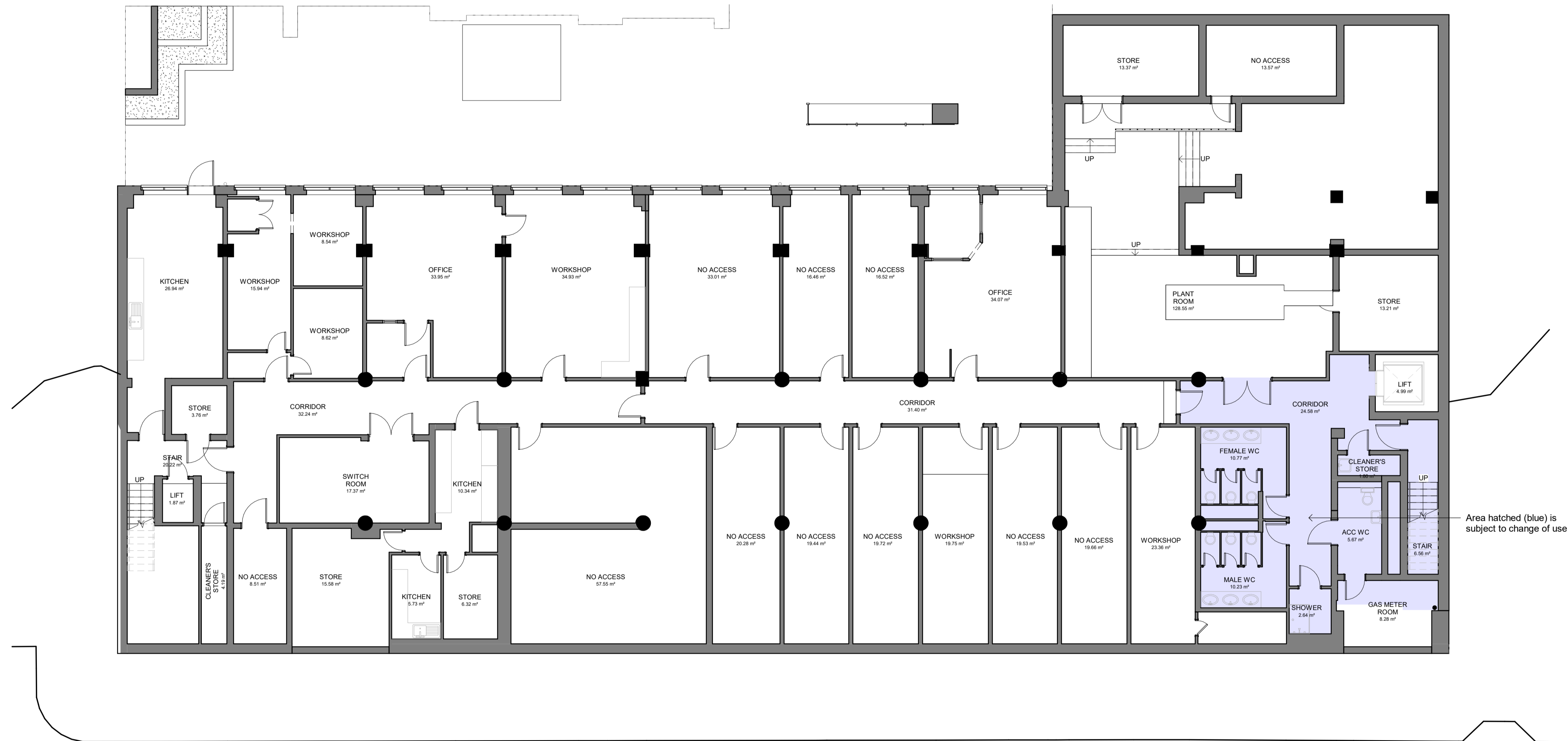
LOWER GROUND FLOOR PLAN 1 : 100

Notes This drawing is the property of Willmore Iles Architects. Copyright is reserved by Willmore Iles Architects and the drawing is issued on the condition that it is not copied, reproduced, retained, or disclosed to any unauthorised person, either wholly or in part, without the consent in writing of Willmore Iles Architects. Any discrepancies must be reported to the Architect.