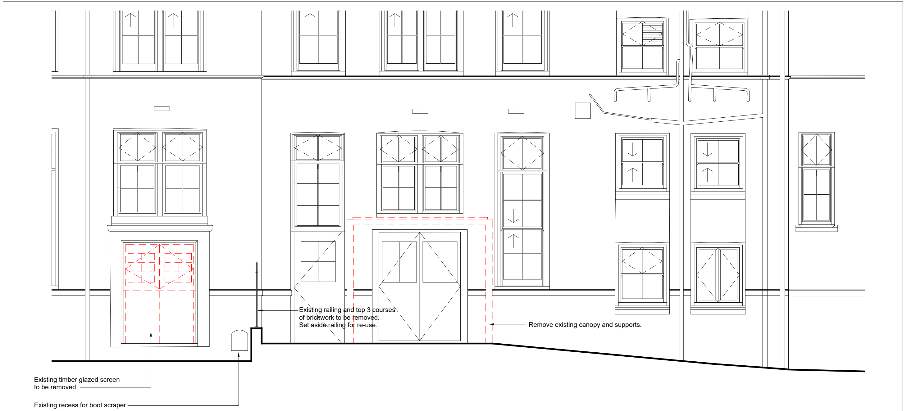
1 Existing Front Elevation A04 Scale 1:50