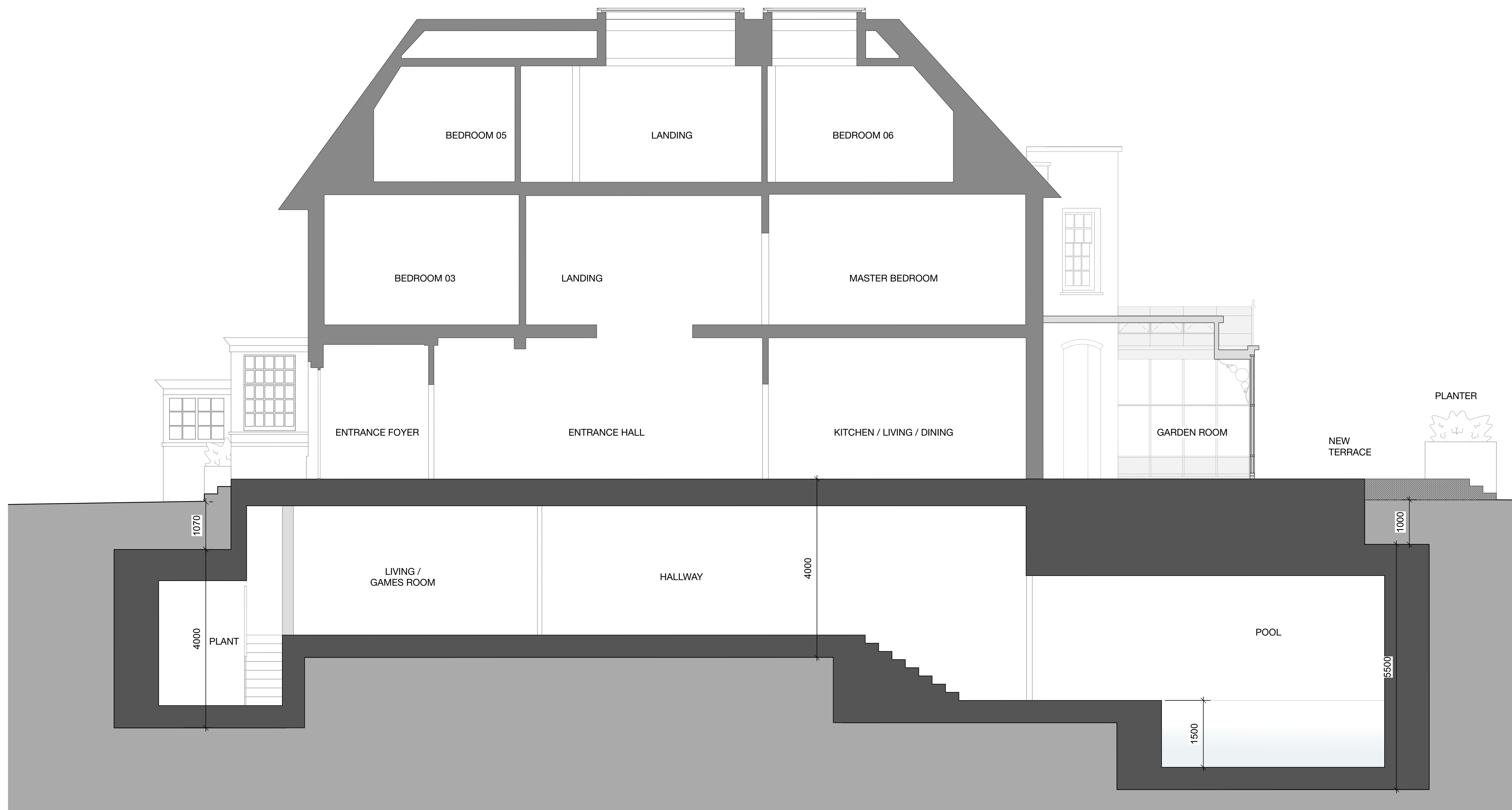
1 PROPOSED SECTION A-A Scale: 1:100@A3

GENERAL NOTES DO NOT SCALE FROM DRAWINGS. ALL DIMENSIONS TO BE CHECKED ON SITE. REPORT OMISSIONS AND DISCREPANCIES TO THE ARCHITECT IMMEDIATELY. REVISION DATES MARKED ON THE DRAWING ARE STATED IN THE FOLLOWING ORDER: YEAR, MONTH, DAY (YY.MM.DD). © MORENO MASEY LTD SURVEY THESE DRAWINGS ARE BASED ON EXISTING DRAWINGS PROVIDED BY ON SITE SURVEYS LTD. IT IS ESSENTIAL THAT ALL DIMENSIONS ARE CHECKED ON SITE AND OMISSIONS AND DISCREPANCIES ARE TO BE REPORTED TO THE ARCHITECT IMMEDIATELY FOR CLARIFICATION. HATCHES THE HATCHES SHOWN ON THIS DRAWING ARE USED FOR THE PURPOSE OF INDICATING AREAS AND QUANTITIES ONLY. THE HATCHES ARE NOT DISPLAYING THE ACTUAL PATTERN, SETTING OUT, SIZING, COLOUR OR APPEARANCE OF THE ACTUAL MATERIALS.