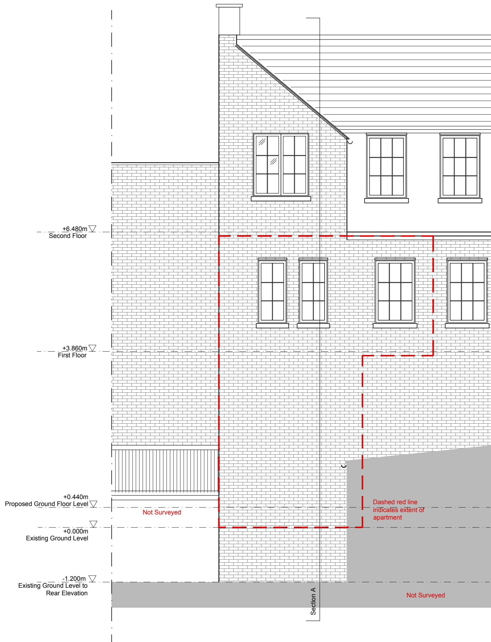
Existing & Proposed Rear Elevation 1:50@A2