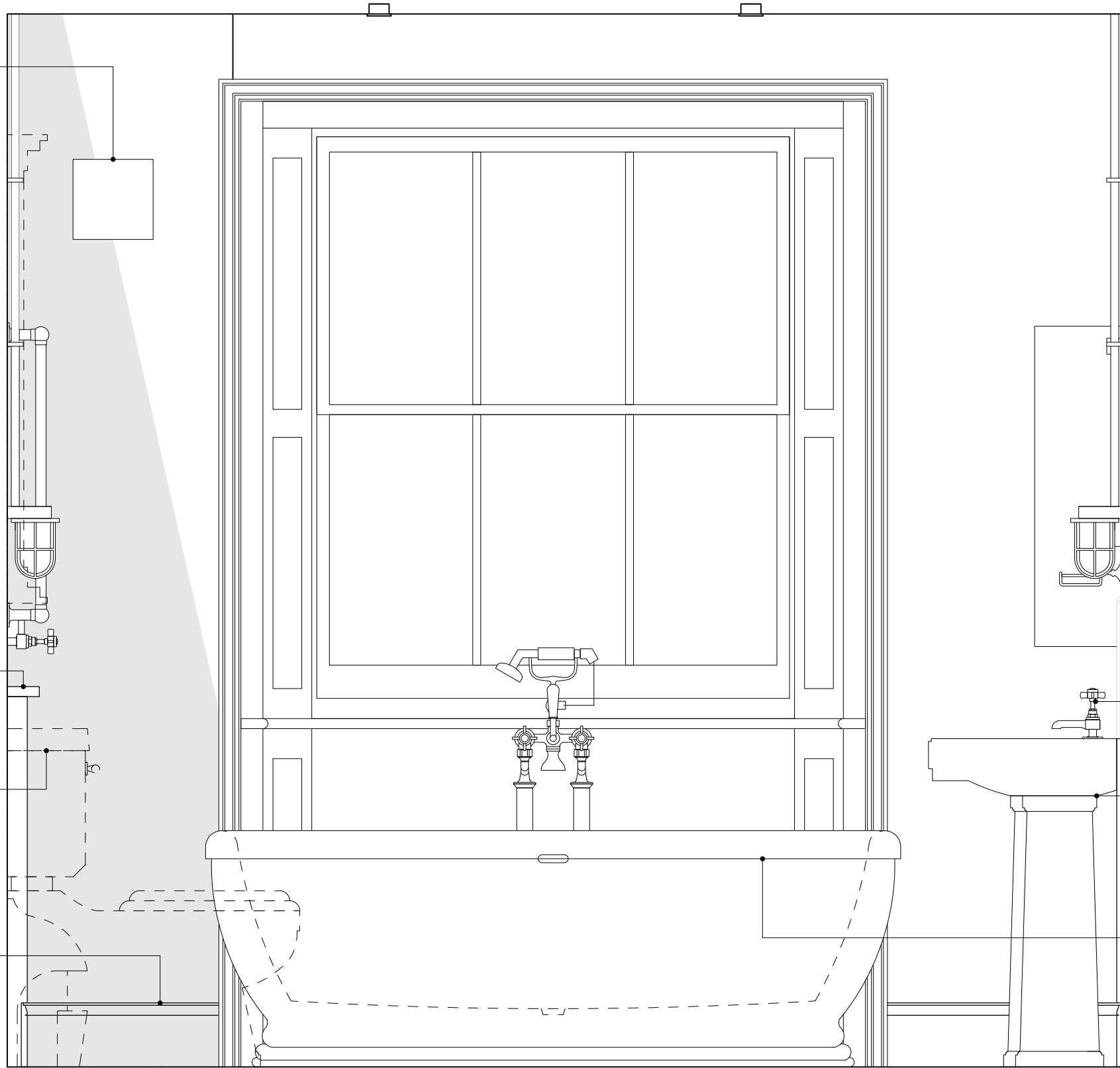
03 ELEVATION 1:25 @ A3