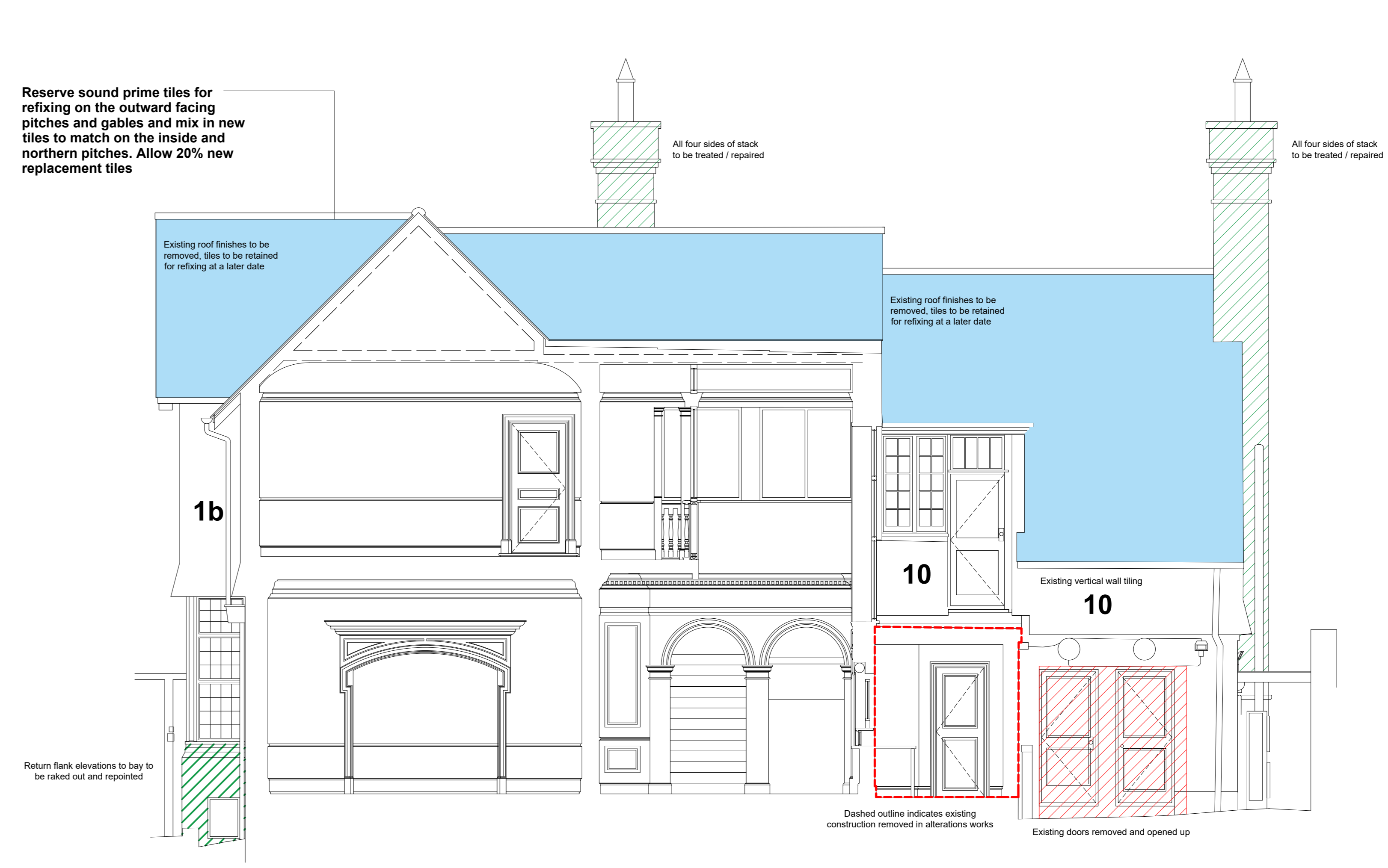
Section D-D East - Main House and Lodge Stone and Brick Repairs