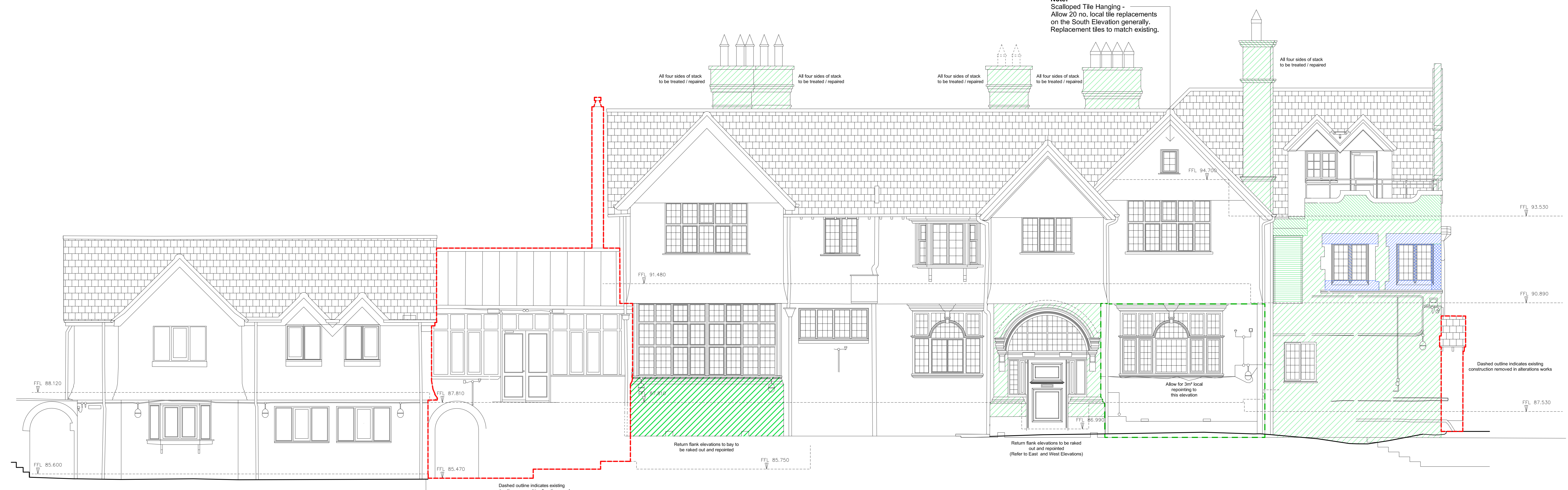
South Elevation - Lodge Stone and Brick Repairs

Note: Scalloped Tile Hanging - Allow 20 no. local tile replacements on the South Elevation generally. Replacement tiles to match existing.