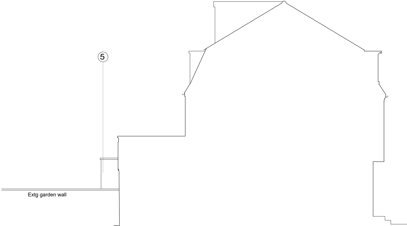
Proposed View from No 13