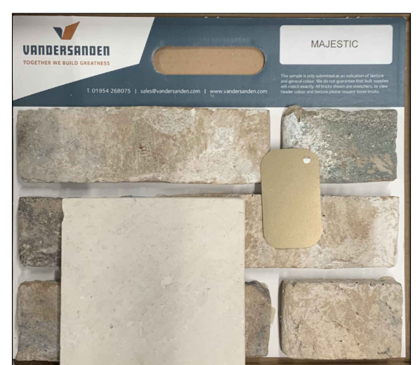
APPROVED SAMPLE PANEL #1