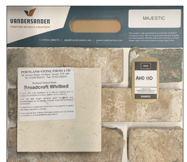
APPROVED SAMPLE PANEL LABELS