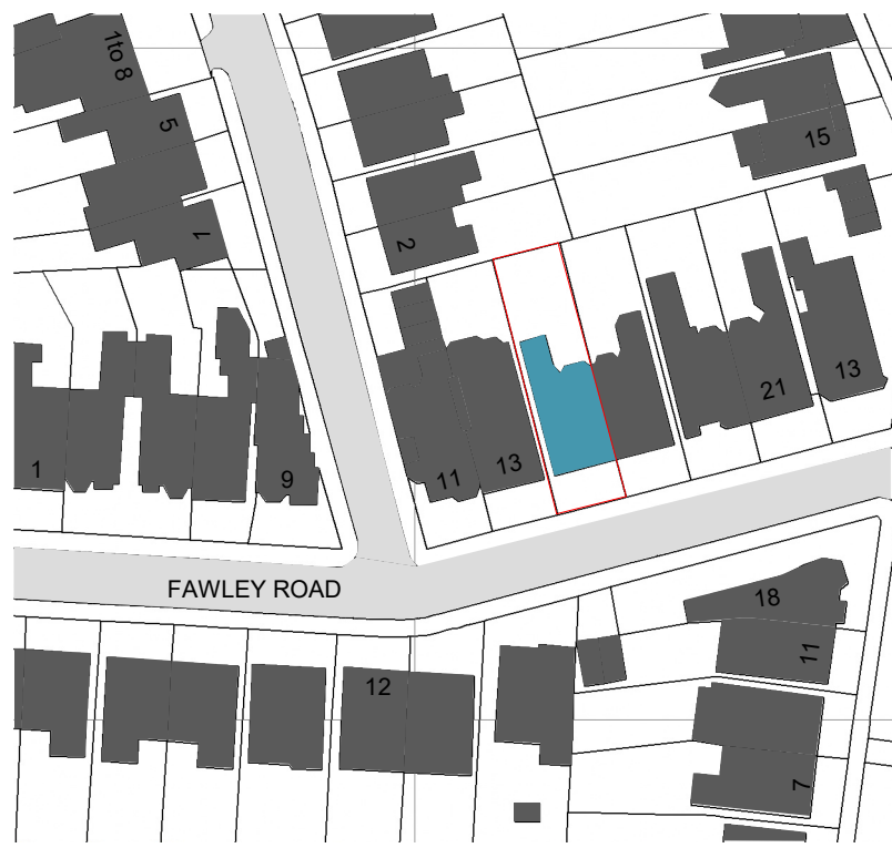
Location Plan 1 : 1250