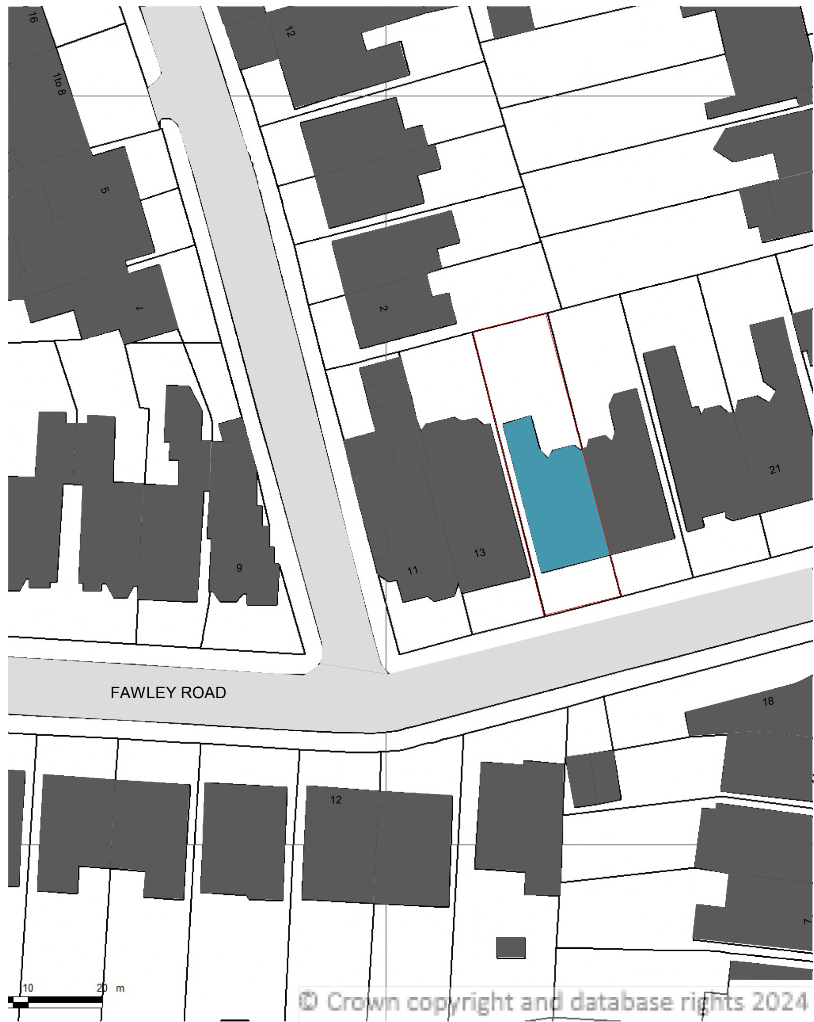
Proposed site plan 1 : 500