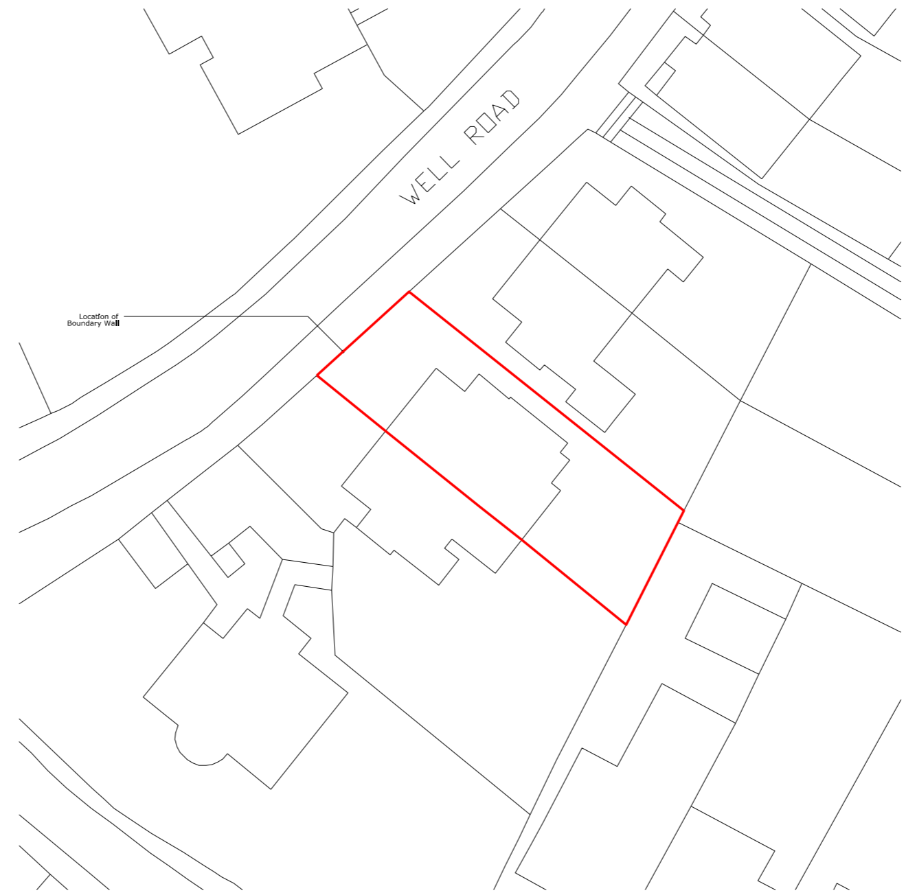
02 SITE PLAN 000 A1/A3 @ 1:200/ 1:400