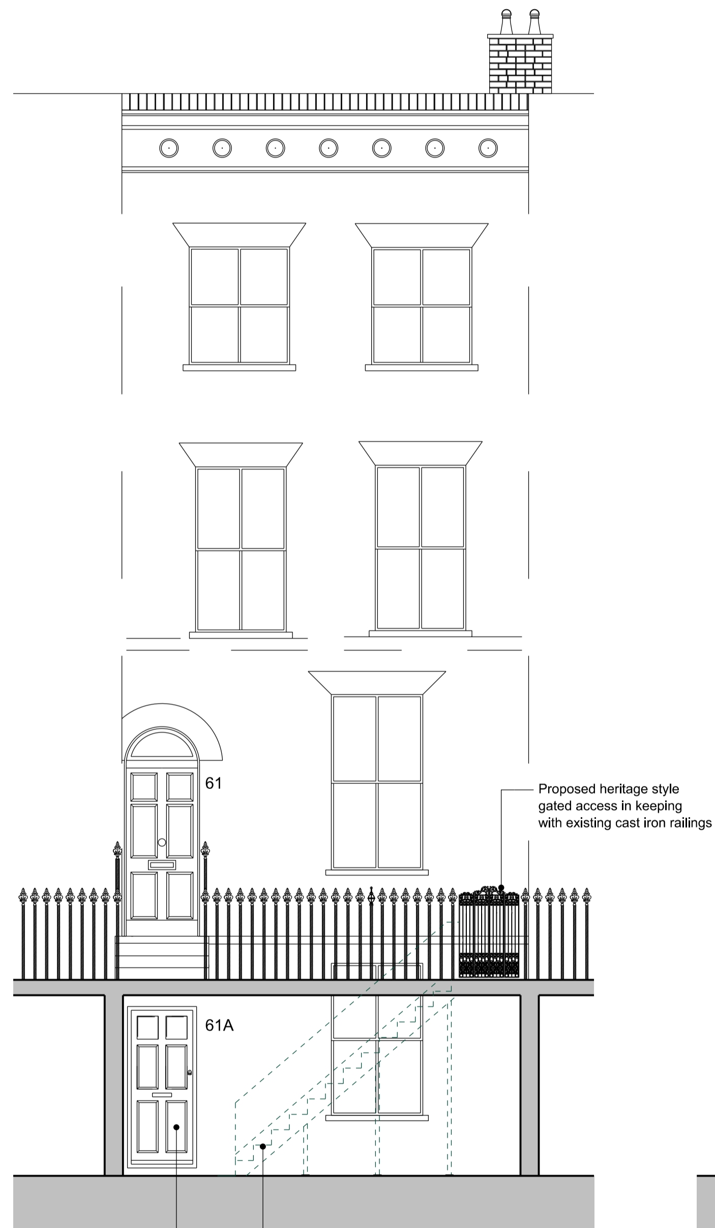
1 Proposed Front Elevation Scale 1:50 @A1 (1:100 @A3)