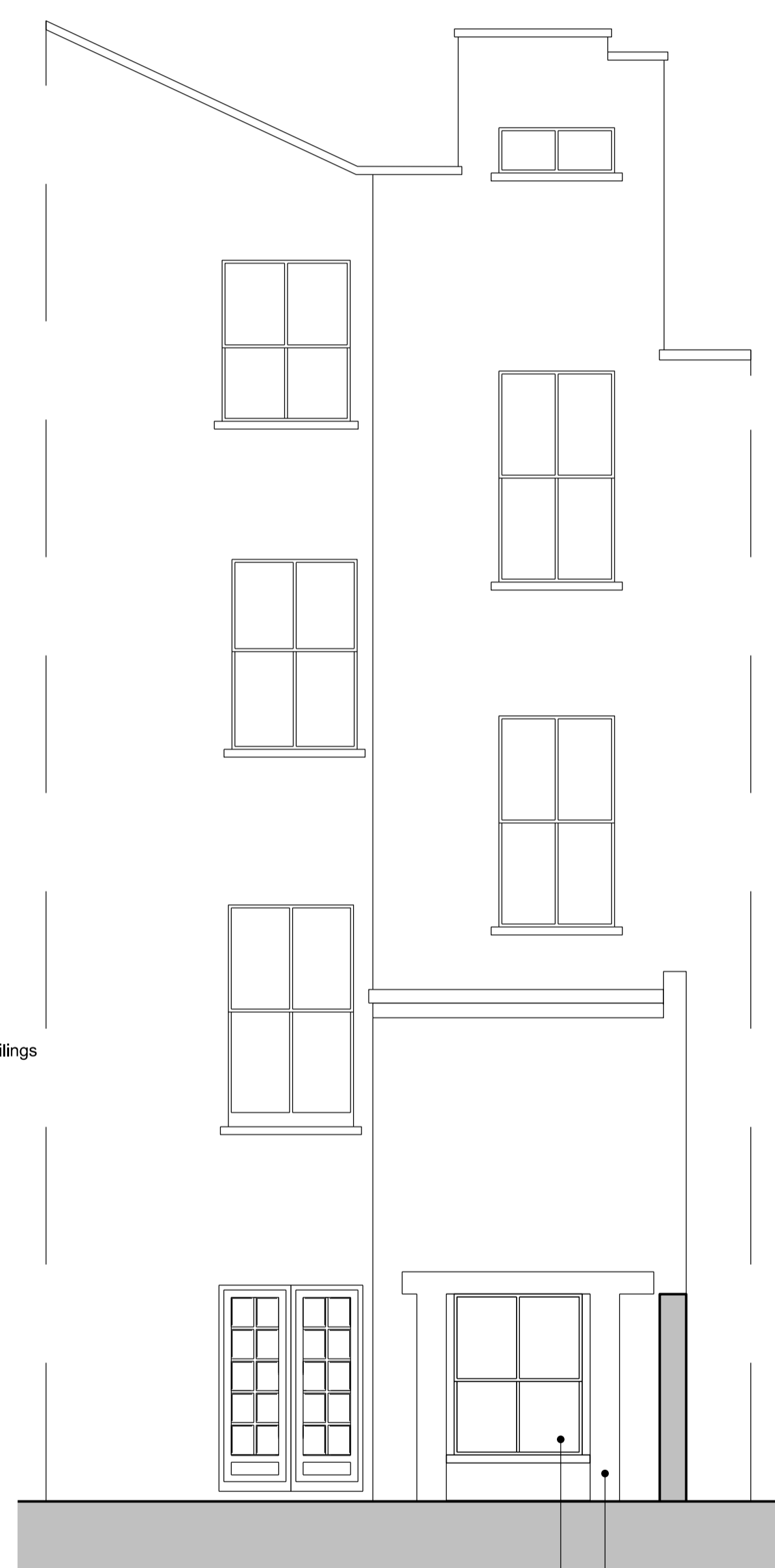
2 Proposed Rear Elevation Scale 1:50 @A1 (1:100 @A3)