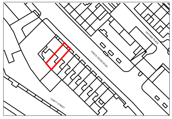
1 Site Location Plan Scale 1:1250 @ A1 (1:2500 @ A3)