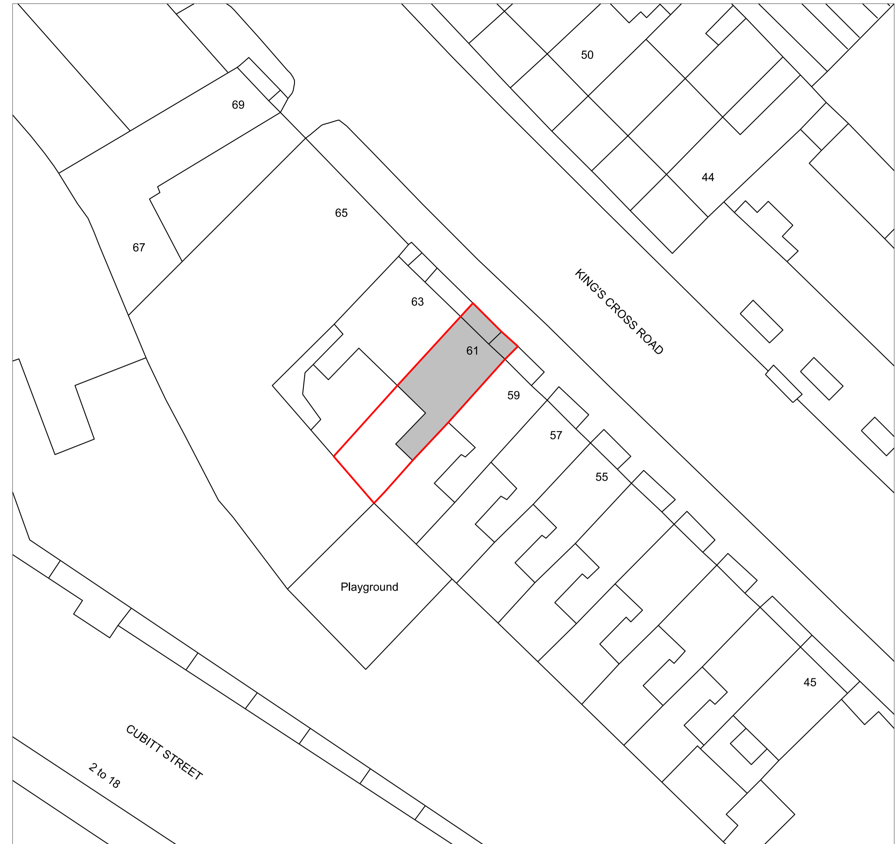
2 Existing Site Plan Scale 1:200 @A1 (1:400 @A3)