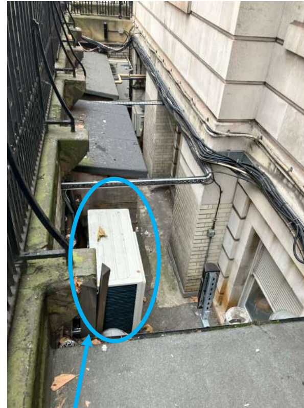
Proposed External Daikin Condenser to be installed in the same exact location with new pipework to follow existing routes and replace those pipes being removed