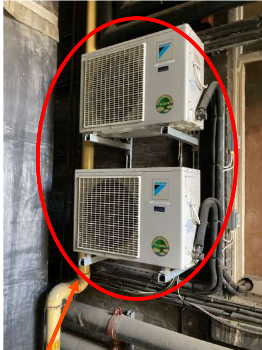
Two redundant External Daikin Condenser units to be removed along with associated pipework fixed to the wall and existing gallow brackets