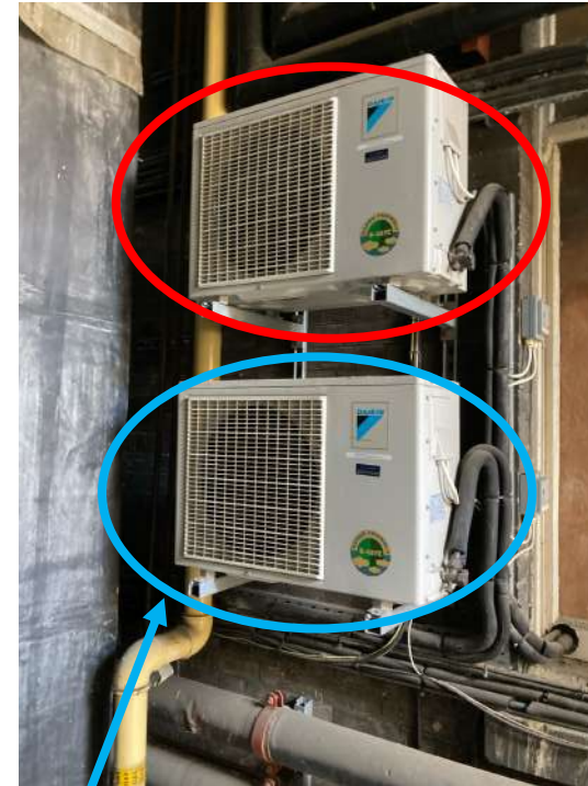
Proposed Single External Condenser unit to replace the redundant two units in the same location with new pipework to follow the exiting routes and new gallow brackets to level of bottom existing unit.