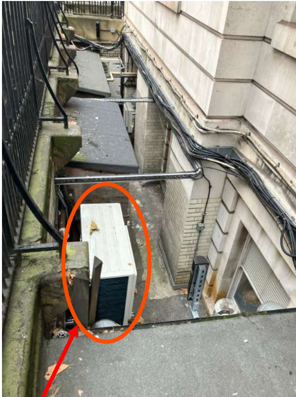
Redundant External Daikin Condenser to be removed along with associated redundant pipework.