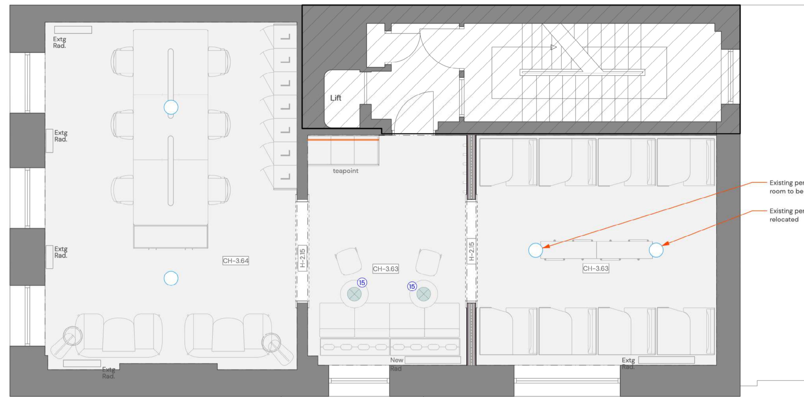
First Floor Plan Scale: 1:50