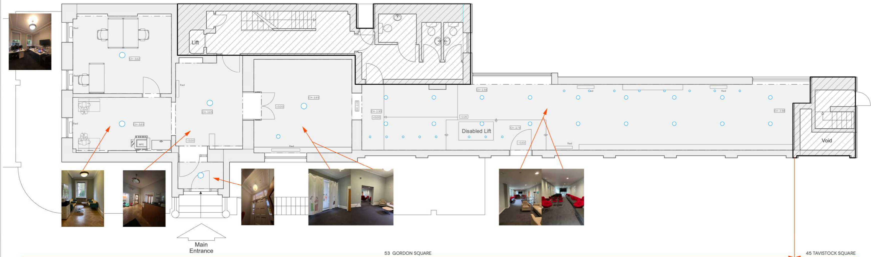
Ground Floor Plan Scale: 1:100